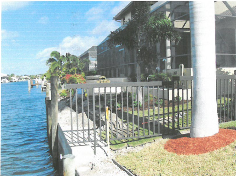
Rear View 2/3/2009