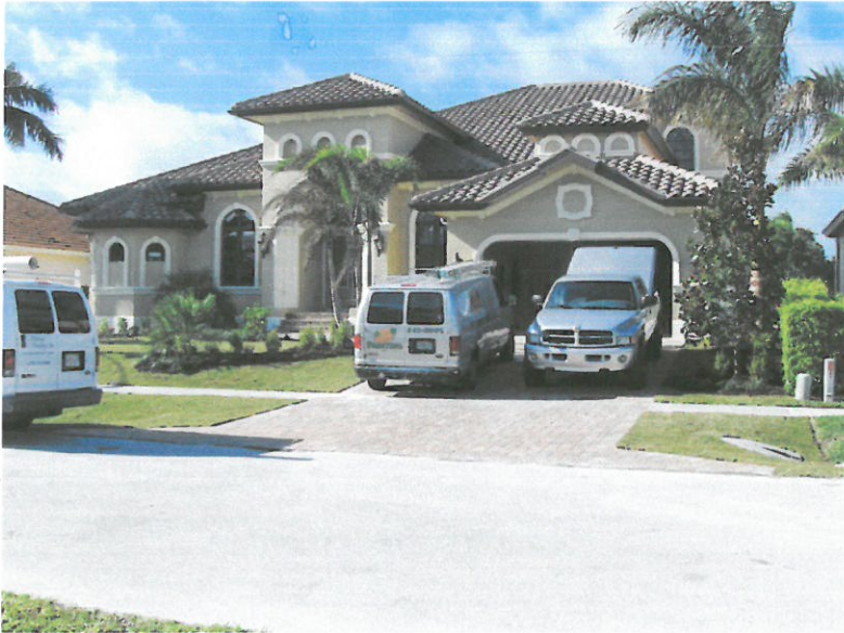
Front View 2/3/2009

If using the Elevation Certificate to obtain NFIP flood insurance, affix at least two building photographs below according to the instructions for Item A6. Identify all photographs with: date taken; "Front View" and "Rear View"; and, if required, "Right Side View" and "Left Side View." If submitting more photographs than will fit on this page, use the Continuation Page, following.