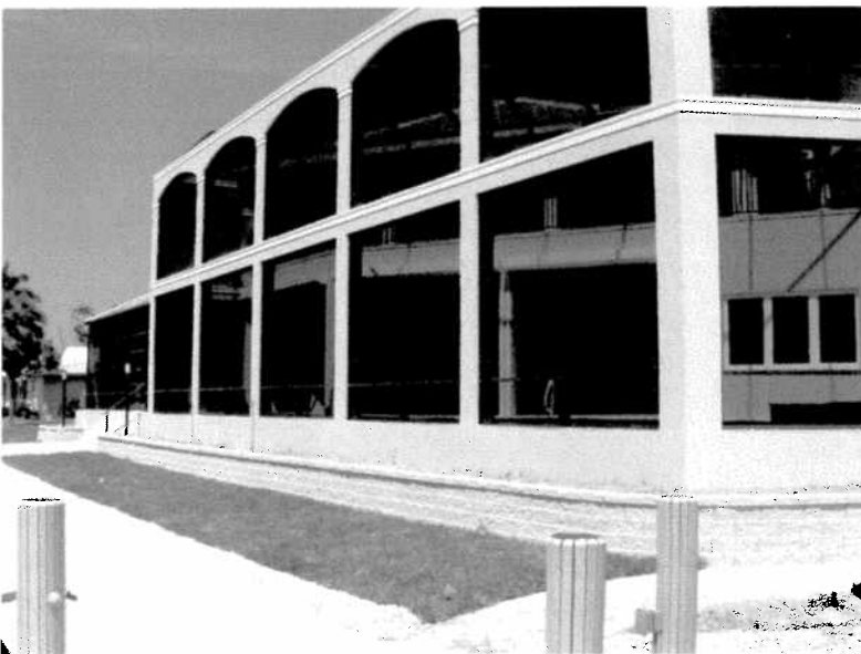
Rear View 3/31/2011