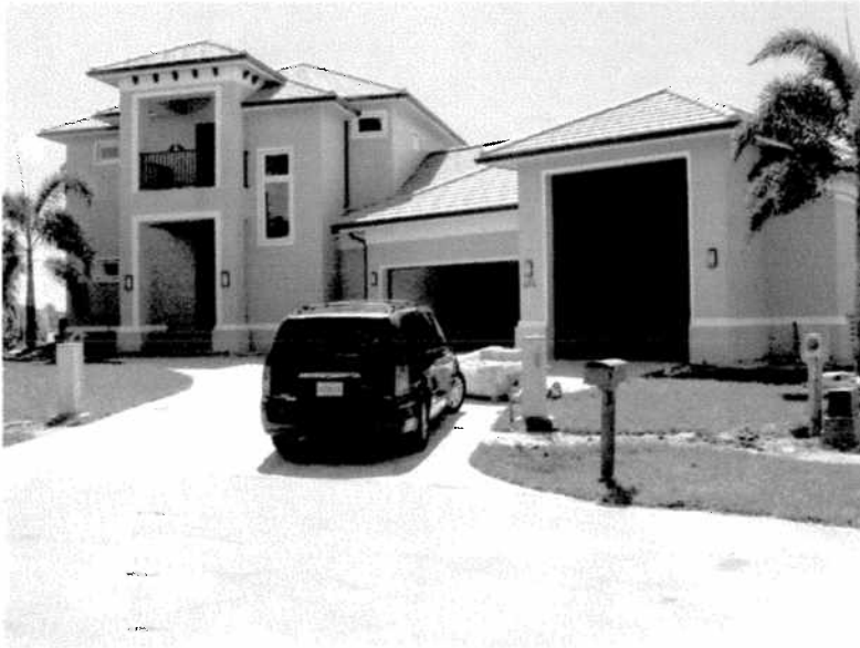
Front View 3/31/2011

If using the Elevation Certificate to obtain NFIP flood insurance, affix at least two building photographs below according to the instructions for Item A6. Identify all photographs with: date taken; "Front View" and "Rear View"; and, if required, "Right Side View" and "Left Side View." If submitting more photographs than will fit on this page, use the Continuation Page, following.