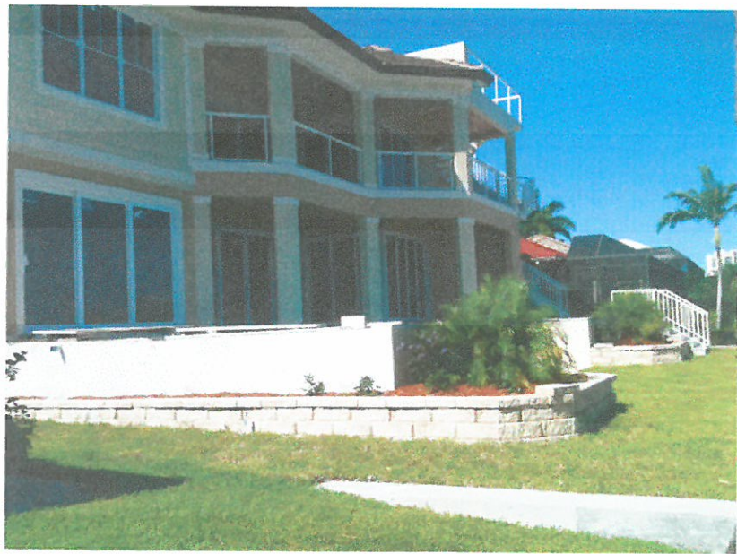
REAR VIEW 9/20/2013