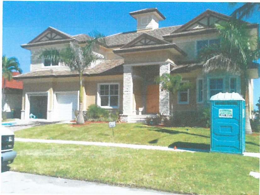
FRONT VIEW 9/20/2013

If using the Elevation Certificate to obtain NFIP flood insurance, affix at least 2 building photographs below according to the instructions for Item A6. Identify all photographs with date taken; "Front View" and "Rear View"; and, if required, "Right Side View" and "Left Side View." When applicable, photographs must show the foundation with representative examples of the flood openings or vents, as indicated in Section A8. If submitting more photographs than will fit on this page, use the Continuation Page.