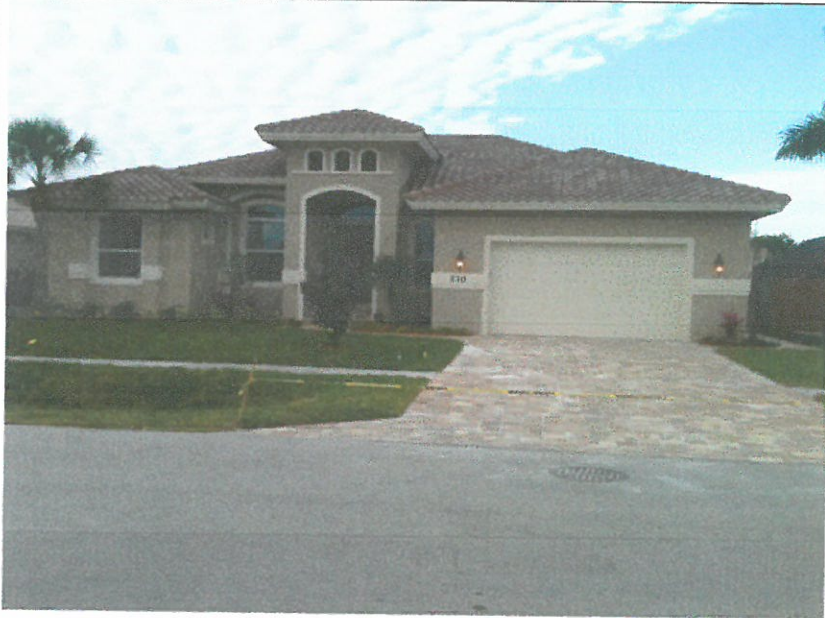
FRONT VIEW 2/3/15

If using the Elevation Certificate to obtain NFIP flood insurance, affix at least 2 building photographs below according to the instructions for Item A6. Identify all photographs with date taken; "Front View" and "Rear View"; and, if required, "Right Side View" and "Left Side View." When applicable, photographs must show the foundation with representative examples of the flood openings or vents, as indicated in Section A8. If submitting more photographs than will fit on this page, use the Continuation Page.