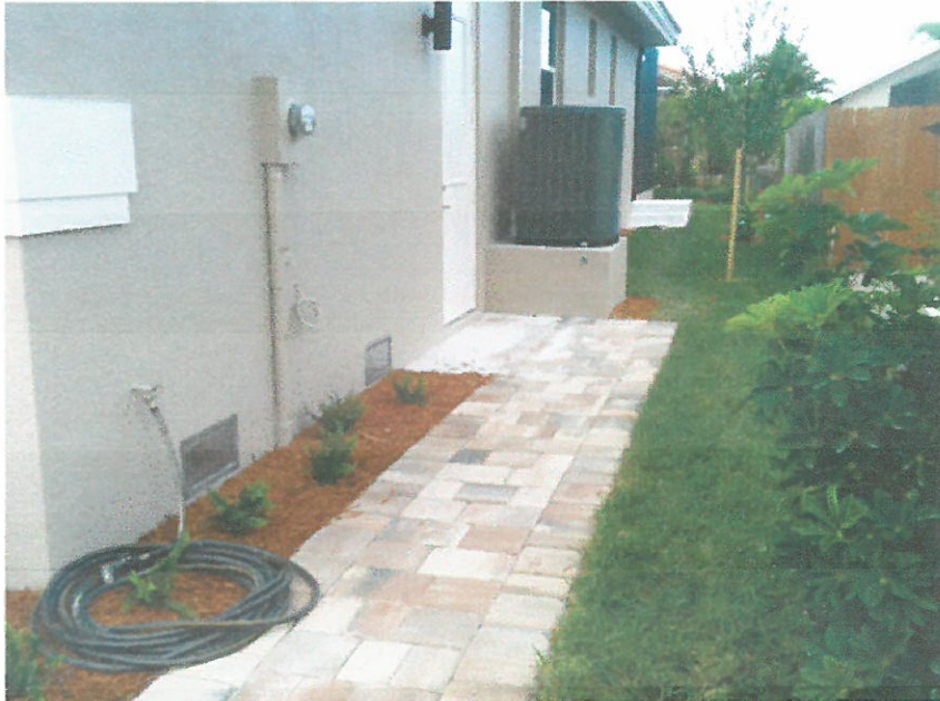
RIGHT SIDE VIEW 2/3/15