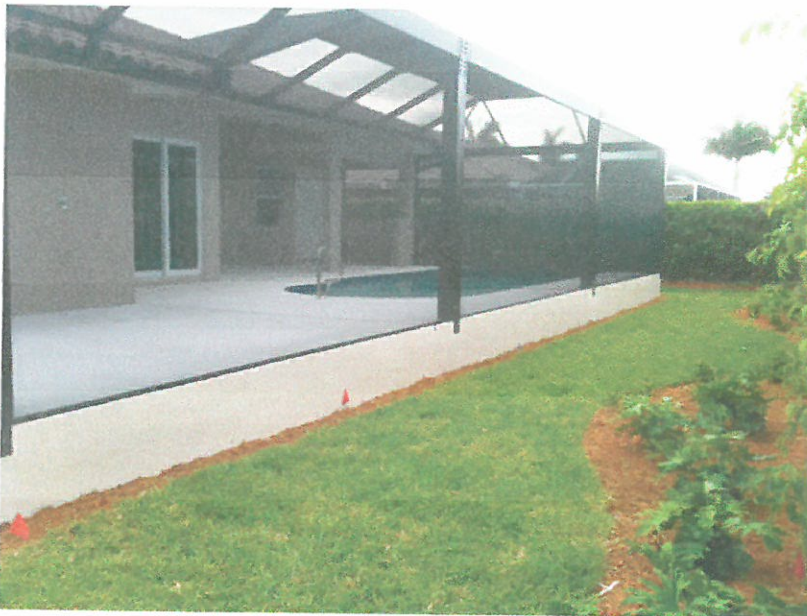
REAR VIEW 2/3/15