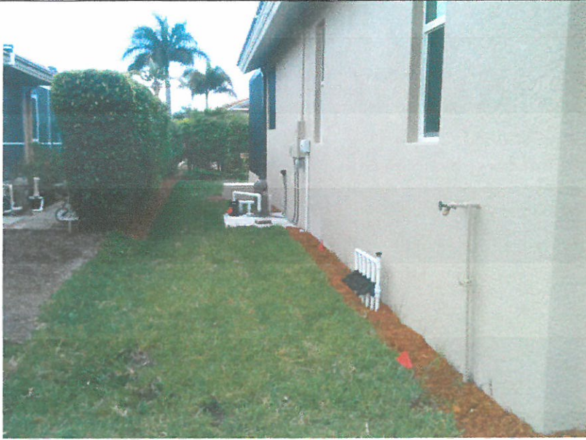
LEFT SIDE VIEW 2/3/15

If submitting more photographs than will fit on the preceding page, affix the additional photographs below. Identify all photographs with: date taken; "Front View" and "Rear View"; and, if required, "Right Side View" and "Left Side View." When applicable, photographs must show the foundation with representative examples of the flood openings or vents, as indicated in Section A8.