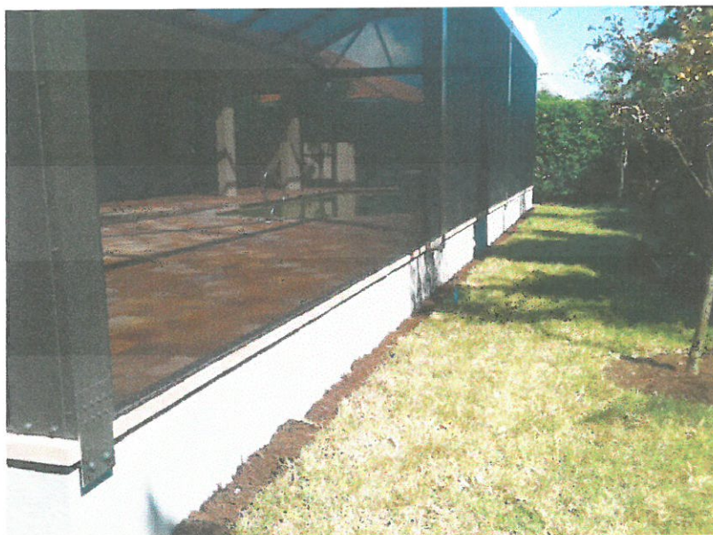
REAR VIEW 10/12/15