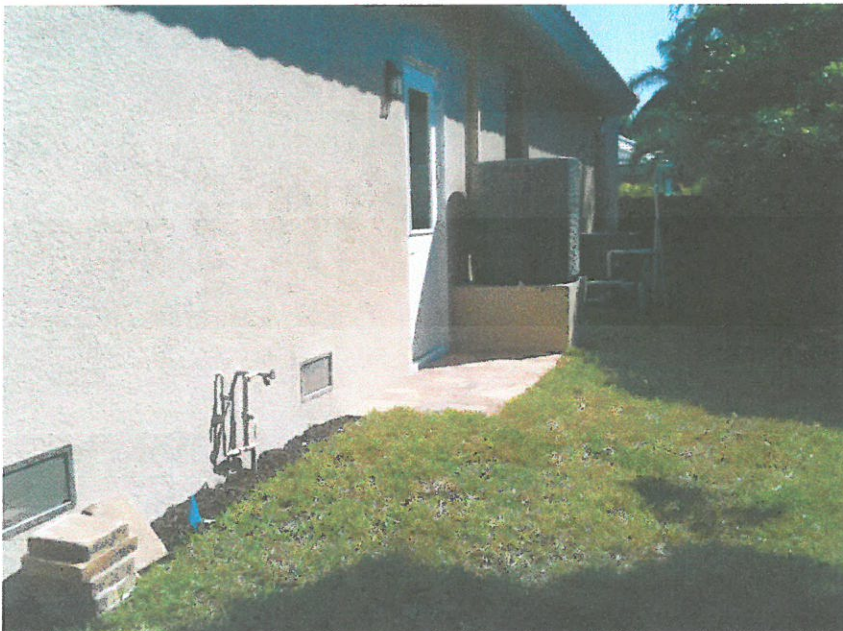
RIGHT SIDE VIEW 10/12/15