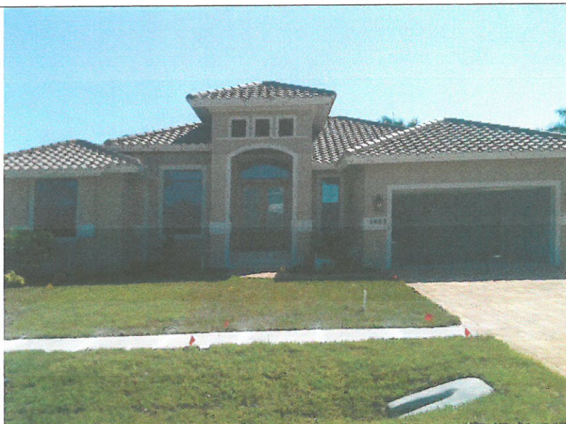
FRONT VIEW 10/12/15

If using the Elevation Certificate to obtain NFIP flood insurance, affix at least 2 building photographs below according to the instructions for Item A6. Identify all photographs with date taken; "Front View" and "Rear View"; and, if required, "Right Side View" and "Left Side View." When applicable, photographs must show the foundation with representative examples of the flood openings or vents, as indicated in Section A8. If submitting more photographs than will fit on this page, use the Continuation Page.