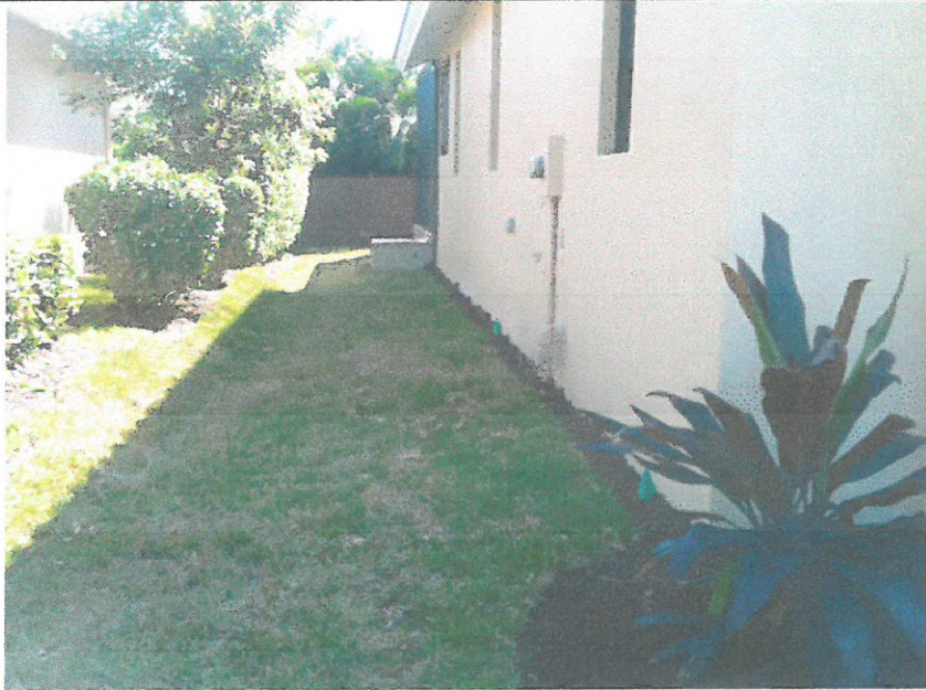
LEFT SIDE VIEW 10/12/15

If submitting more photographs than will fit on the preceding page, affix the additional photographs below. Identify all photographs with: date taken; "Front View" and "Rear View"; and, if required, "Right Side View" and "Left Side View." When applicable, photographs must show the foundation with representative examples of the flood openings or vents, as indicated in Section A8.