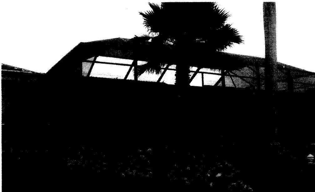
Rear View (4/30/2012)