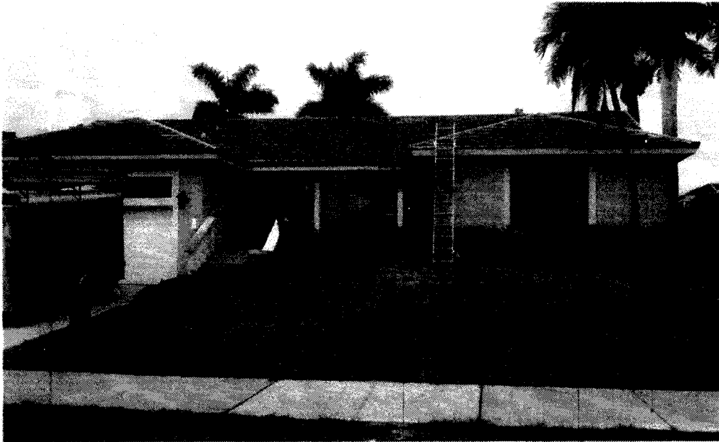
Front View (4/30/2012)

If using the Elevation Certificate to obtain NFIP flood insurance, affix at least two building photographs below according to the instructions for Item A6. Identify all photographs with: date taken; "Front View" and "Rear View"; and, if required, "Right Side View" and "Left Side View." If submitting more photographs than will fit on this page, use the Continuation Page, following.