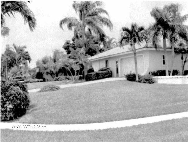
Left Side View 8/09/07

If using the Elevation Certificate to obtain NFIP flood insurance, affix at least two building photographs below according to the instructions for Item A6. Identify all photographs with: date taken; "Front View" and "Rear View"; and, if required, "Right Side View" and "Left Side View." If submitting more photographs than will fit on this page, use the Continuation Page, following.