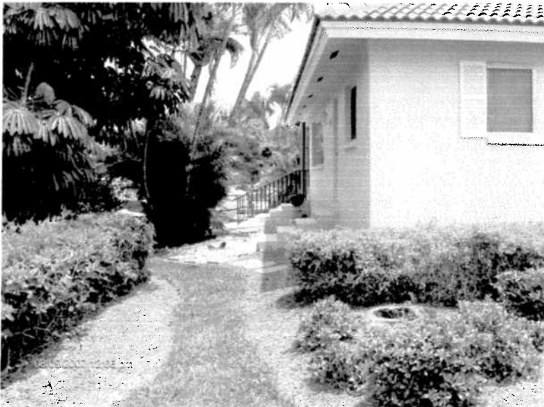
Rear View 8/09/07