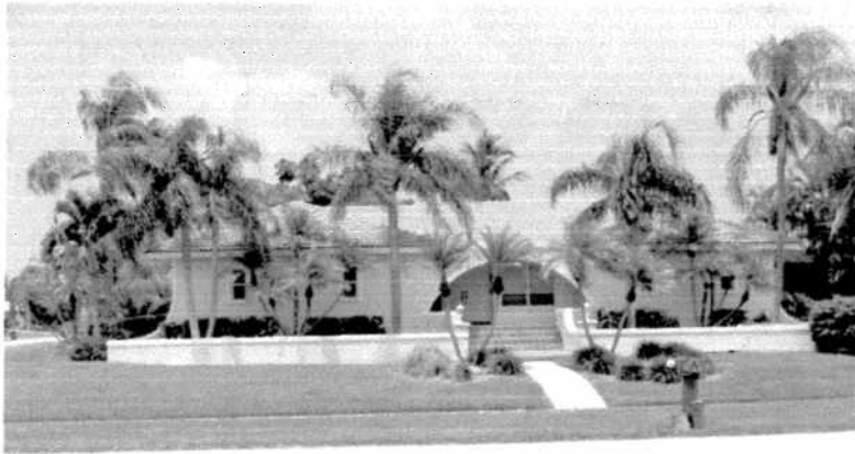
Front View 8/09/07

If using the Elevation Certificate to obtain NFIP flood insurance, affix at least two building photographs below according to the instructions for Item A6. Identify all photographs with: date taken; "Front View" and "Rear View"; and, if required, "Right Side View" and "Left Side View." If submitting more photographs than will fit on this page, use the Continuation Page, following.