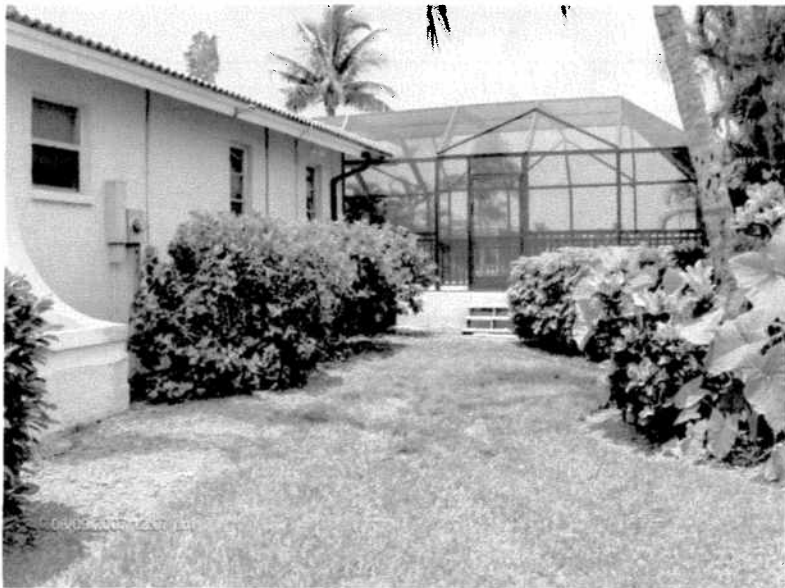
Right Side View 8/09/07