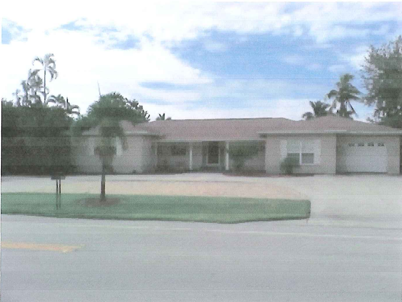
FRONT VIEW 10/27/2011