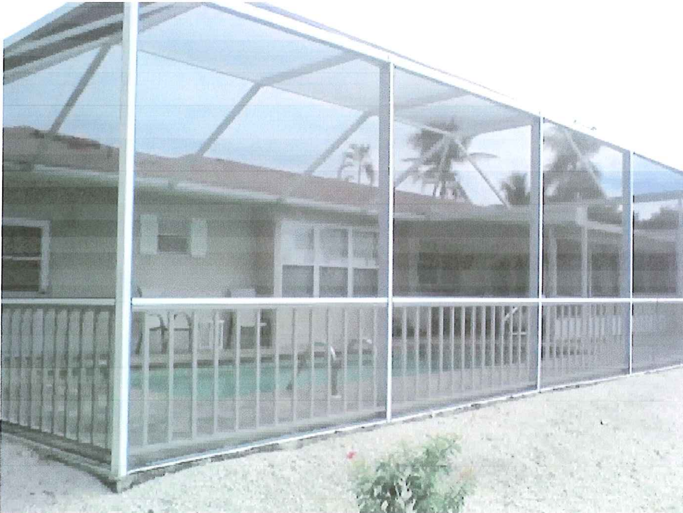
REAR VIEW 10/27/2011

If submitting more photographs than will fit on the preceding page, affix the additional photographs below. Identify all photographs with: date taken; "Front View" and "Rear View"; and, if required, "Right Side View" and "Left Side View."