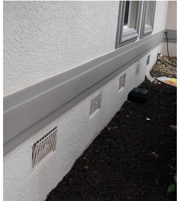
Photo One Caption Photo Taken 12/11/2018 "Side View" and "View of Flood Openings"