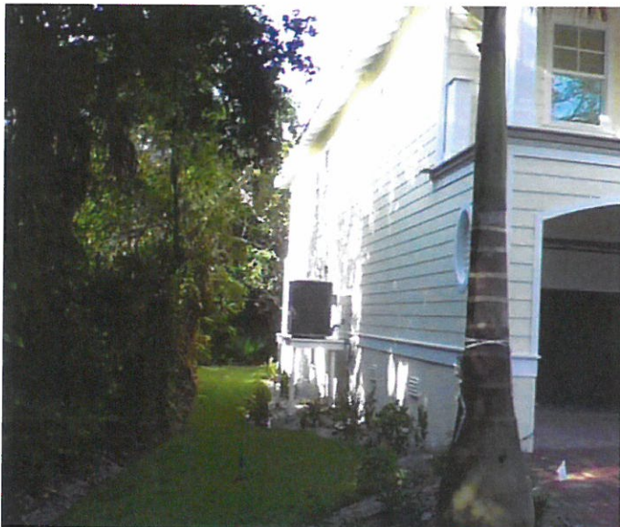
Left Side View 06/11/2014