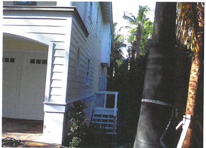
Right Side View 06/11/2014