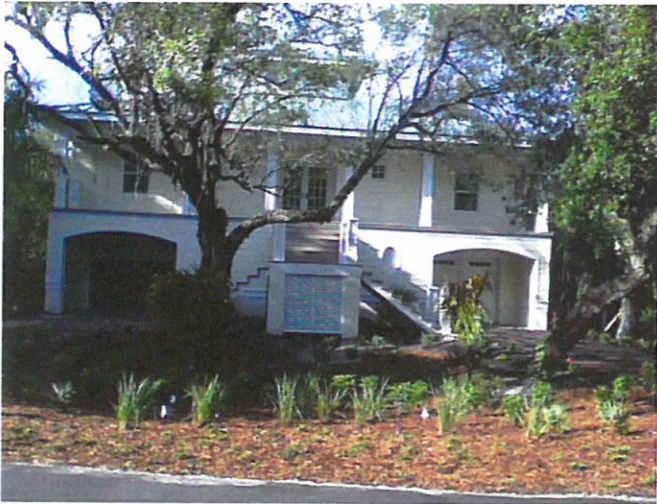
Front View 06/11/2014