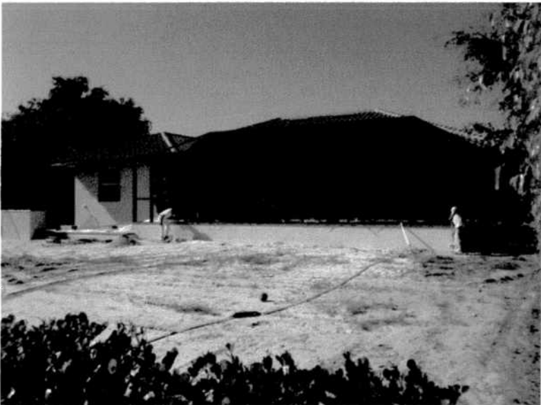
Rear View 11/28/2011