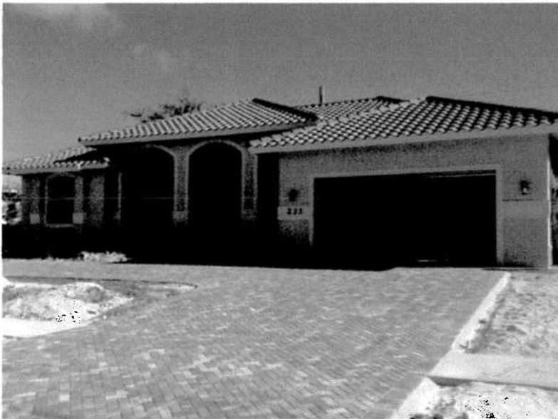
Front View 11/28/2011