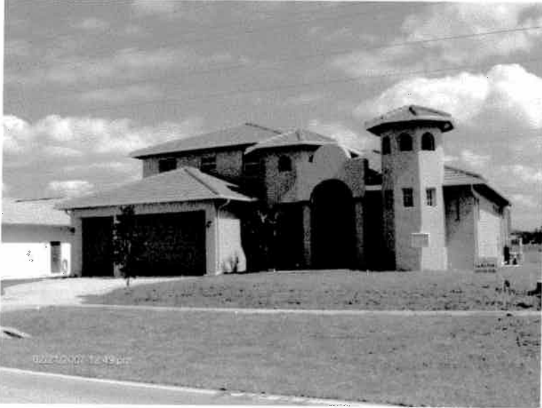
Left Side View 2/21/07

If using the Elevation Certificate to obtain NFIP flood insurance, affix at least two building photographs below according to the instructions for Item A6. Identify all photographs with: date taken; "Front View" and "Rear View"; and, if required, "Right Side View" and "Left Side View." If submitting more photographs than will fit on this page, use the Continuation Page, following.