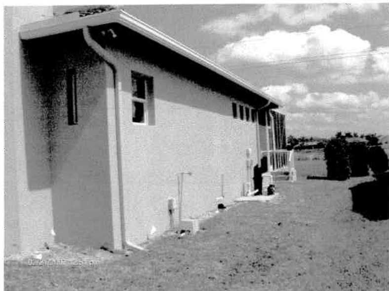
Right Side View 2/21/07