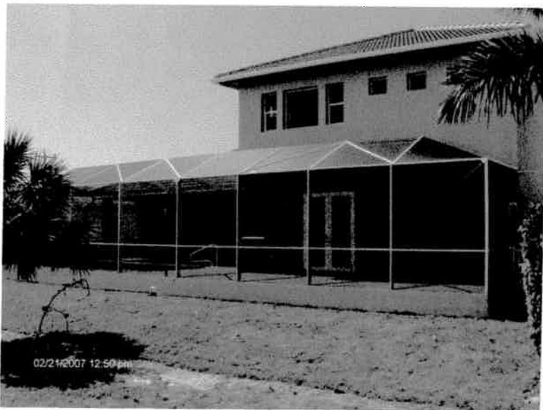
Right Side View 2/21/07