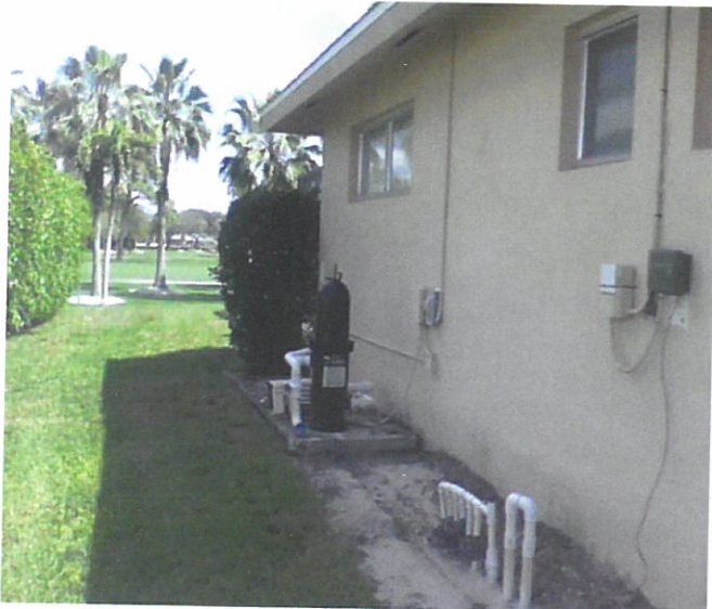
Left Side View 03/03/2015