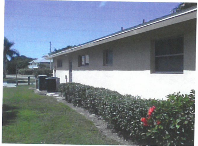
Right Side View 03/03/2015