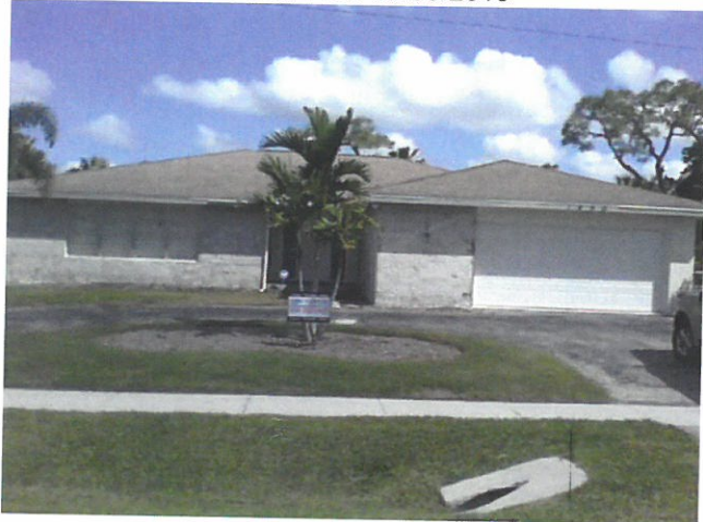
Front View 03/03/2015