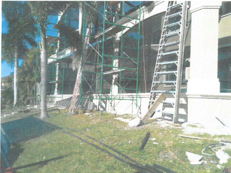
REAR VIEW 1/7/16