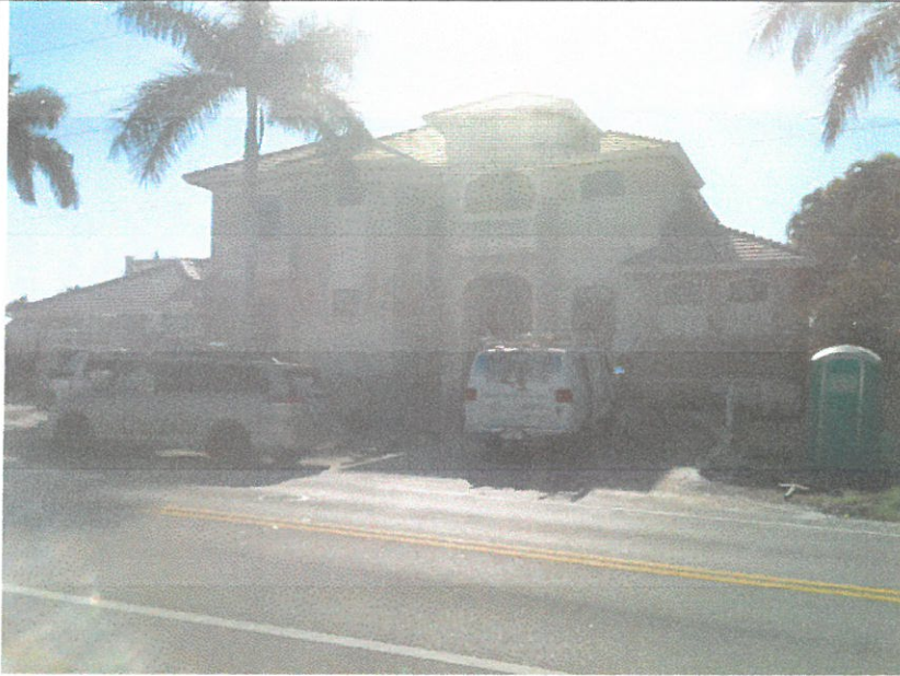
FRONT VIEW 1/7/16

If using the Elevation Certificate to obtain NFIP flood insurance, affix at least 2 building photographs below according to the instructions for Item A6. Identify all photographs with date taken; "Front View" and "Rear View"; and, if required, "Right Side View" and "Left Side View." When applicable, photographs must show the foundation with representative examples of the flood openings or vents, as indicated in Section A8. If submitting more photographs than will fit on this page, use the Continuation Page.