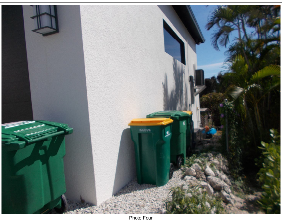
Photo Four Caption : Right Side View (SW) with A/C Unit on 02/10/2021