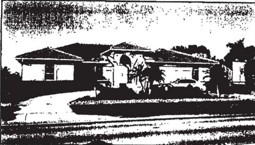
Front View (12/20/2012)

If using the Elevation Certificate to obtain NFIP flood insurance, affix at least two building photographs below according to the instructions for Item A6. Identify all photographs with: date taken; "Front View" and "Rear View"; and, if required, "Right Side View" and "Left Side View." If submitting more photographs than will fit on this page, use the Continuation Page, following.