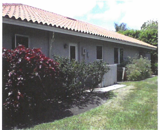
Right Side View 05/13/2014