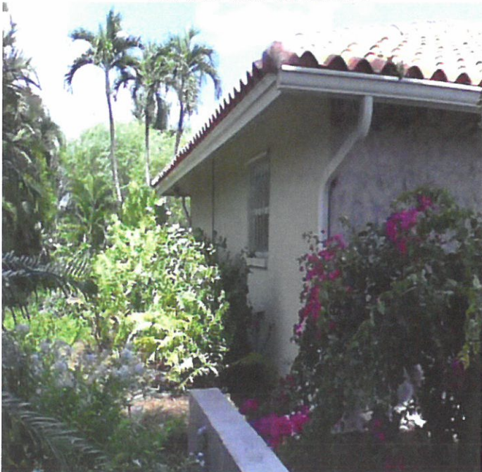
Left Side View 05/13/2014