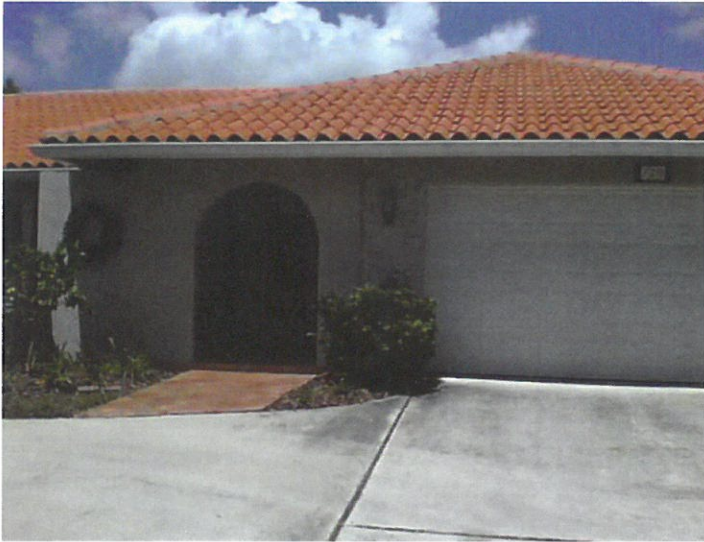
Front View 05/13/2014