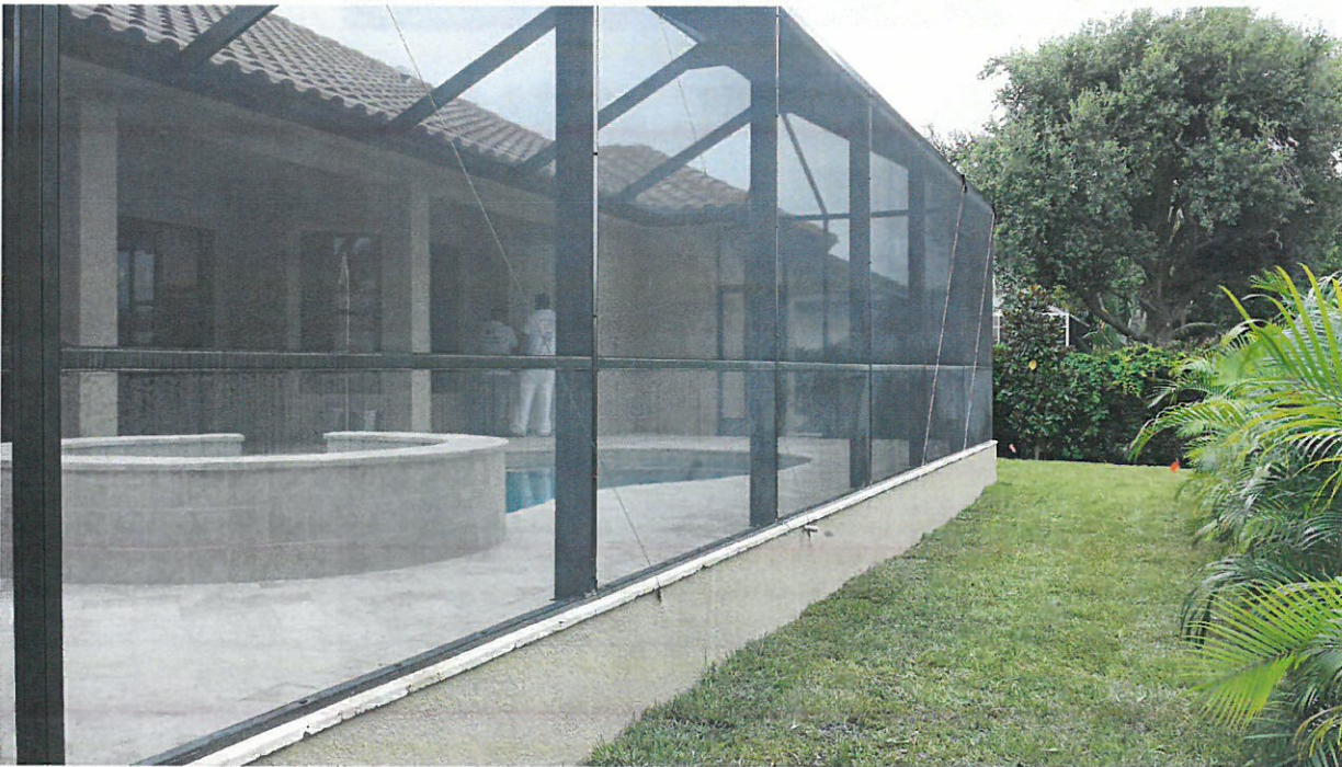
REAR VIEW - 06/03/2014