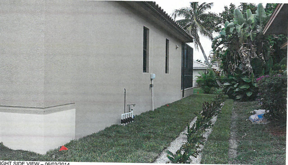
RIGHT SIDE VIEW - 06/03/2014