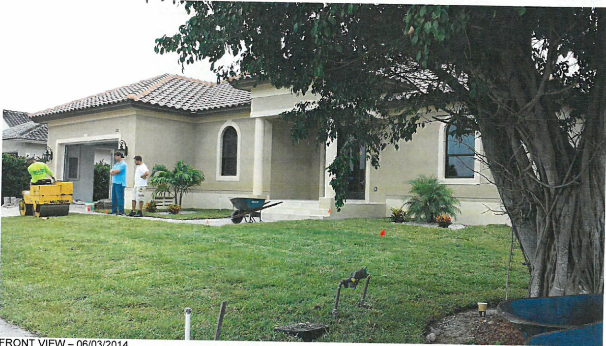
FRONT VIEW - 06/03/2014

If using the Elevation Certificate to obtain NFIP flood insurance, affix at least 2 building photographs below according to the instructions for Item A6. Identify all photographs with date taken; "Front View" and "Rear View"; and, if required, "Right Side View" and "Left Side View." When applicable, photographs must show the foundation with representative examples of the flood openings or vents, as indicated in Section A8. If submitting more photographs than will fit on this page, use the Continuation Page.