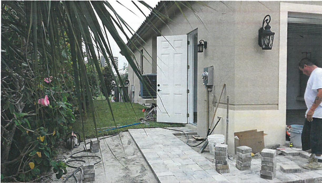
LEFT SIDE VIEW - 06/03/2014

If submitting more photographs than will fit on the preceding page, affix the additional photographs below. Identify all photographs with: date taken; "Front View" and "Rear View"; and, if required, "Right Side View" and "Left Side View." When applicable, photographs must show the foundation with representative examples of the flood openings or vents, as indicated in Section A8.