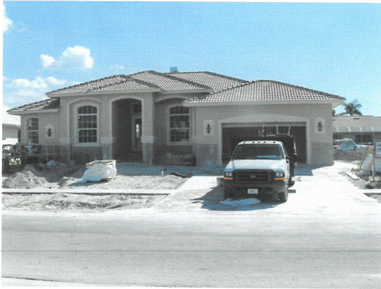
Front View 11/21/2008

If using the Elevation Certificate to obtain NFIP flood insurance, affix at least two building photographs below according to the instructions for Item A6. Identify all photographs with: date taken; "Front View" and "Rear View"; and, if required, "Right Side View" and "Left Side View." If submitting more photographs than will fit on this page, use the Continuation Page, following.