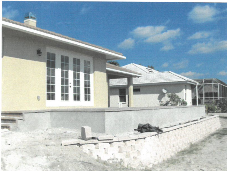
Rear View 11/21/2008