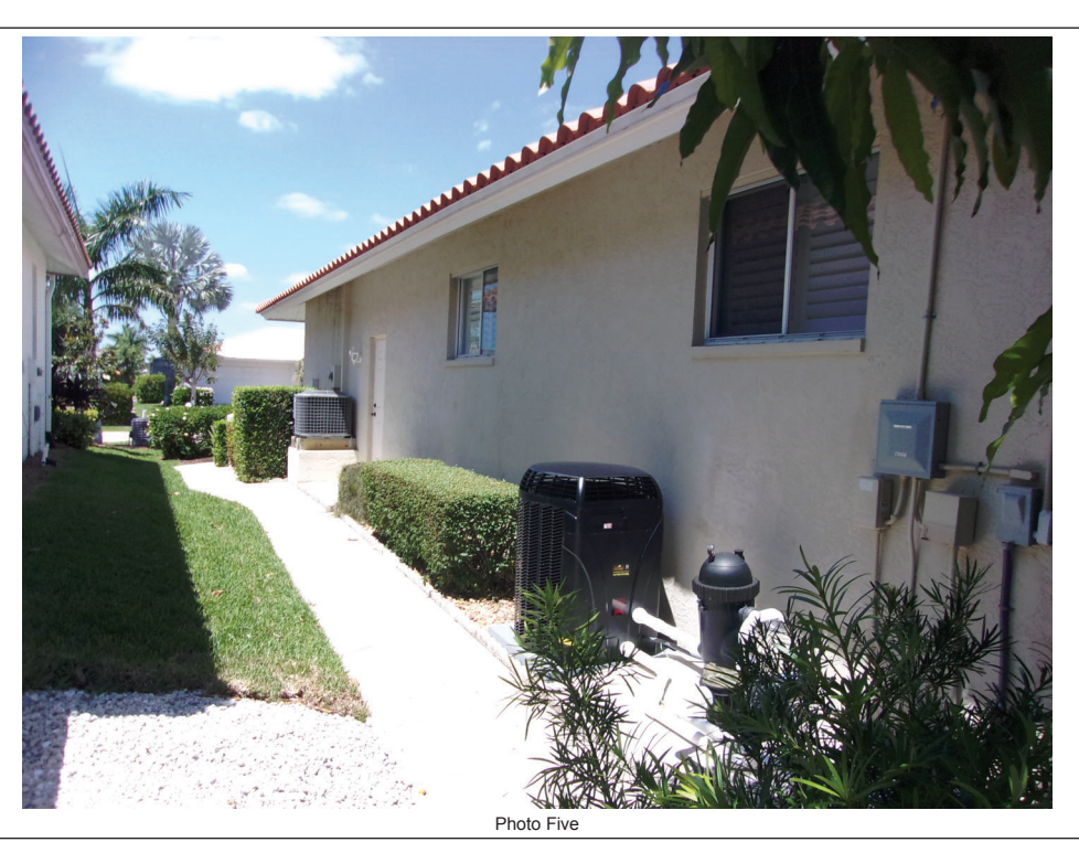
Photo Five Caption : Right Side View #2 (W) with A/C Pad on 04/22/2019

If submitting more photographs than will fit on the preceding page, affix the additional photographs below. Identify all photographs with: date taken; "Front View" and "Rear View"; and, if required, "Right Side View" and "Left Side View." When applicable, photographs must show the foundation with representative examples of the flood openings or vents, as indicated in Section A8.