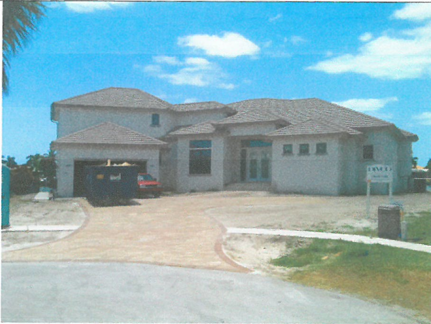
FRONT VIEW 5/21/2014

If using the Elevation Certificate to obtain NFIP flood insurance, affix at least 2 building photographs below according to the instructions for Item A6. Identify all photographs with date taken; "Front View" and "Rear View"; and, if required, "Right Side View" and "Left Side View." When applicable, photographs must show the foundation with representative examples of the flood openings or vents, as indicated in Section A8. If submitting more photographs than will fit on this page, use the Continuation Page.