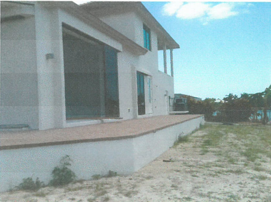
REAR VIEW 5/21/2014