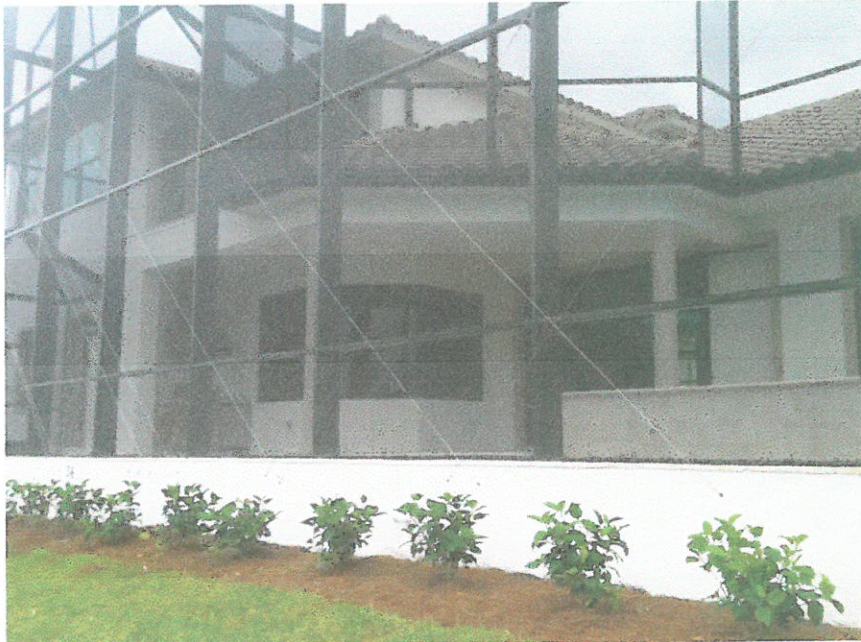
REAR VIEW 4/19/14