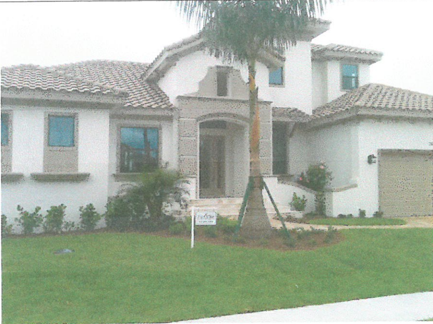
FRONT VIEW 4/19/14

If using the Elevation Certificate to obtain NFIP flood insurance, affix at least 2 building photographs below according to the instructions for Item A6. Identify all photographs with date taken; "Front View" and "Rear View"; and, if required, "Right Side View" and "Left Side View." When applicable, photographs must show the foundation with representative examples of the flood openings or vents, as indicated in Section A8. If submitting more photographs than will fit on this page, use the Continuation Page.