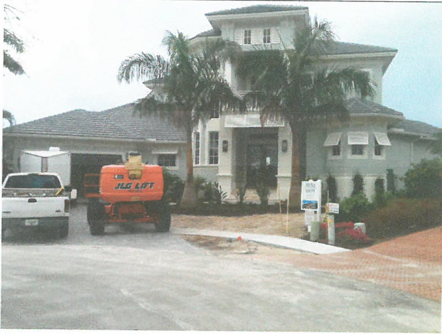
FRONT VIEW 1/31/14

If using the Elevation Certificate to obtain NFIP flood insurance, affix at least 2 building photographs below according to the instructions for Item A6. Identify all photographs with date taken; "Front View" and "Rear View"; and, if required, "Right Side View" and "Left Side View." When applicable, photographs must show the foundation with representative examples of the flood openings or vents, as indicated in Section A8. If submitting more photographs than will fit on this page, use the Continuation Page.