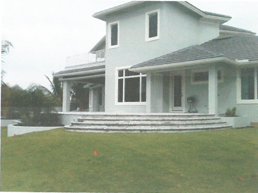
REAR VIEW 1/31/14