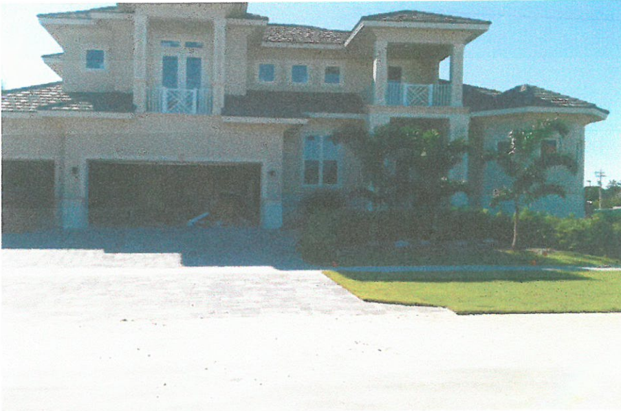
FRONT VIEW 11/23/2015

If using the Elevation Certificate to obtain NFIP flood insurance, affix at least 2 building photographs below according to the instructions for Item A6. Identify all photographs with date taken; "Front View" and "Rear View"; and, if required, "Right Side View" and "Left Side View." When applicable, photographs must show the foundation with representative examples of the flood openings or vents, as indicated in Section A8. If submitting more photographs than will fit on this page, use the Continuation Page.