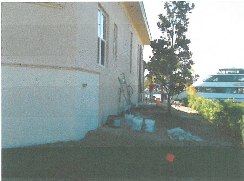
RIGHT SIDE VIEW 11/23/2015