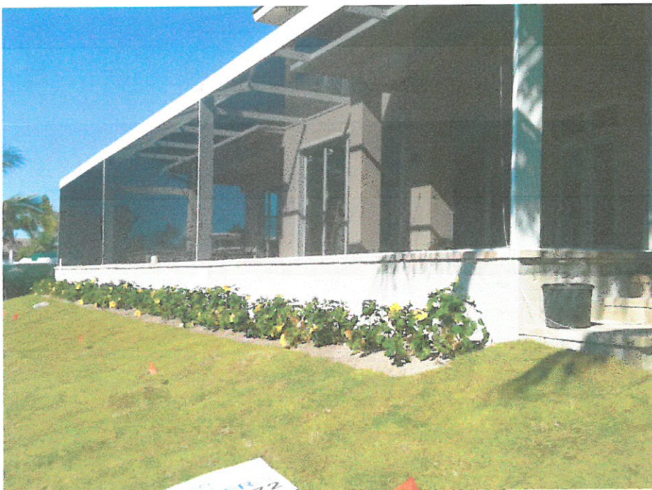
REAR VIEW 11/23/2015