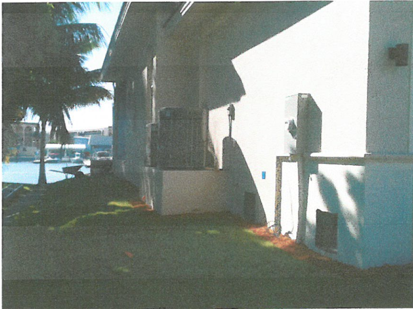
LEFT SIDE VIEW 11/23/2015

If submitting more photographs than will fit on the preceding page, affix the additional photographs below. Identify all photographs with: date taken; "Front View" and "Rear View"; and, if required, "Right Side View" and "Left Side View." When applicable, photographs must show the foundation with representative examples of the flood openings or vents, as indicated in Section A8.