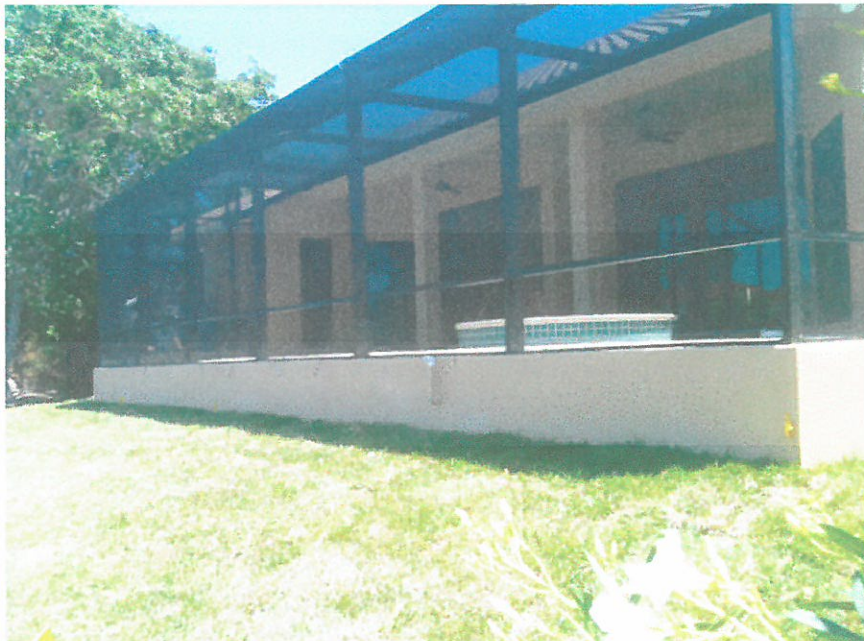
REAR VIEW 4/24/2014