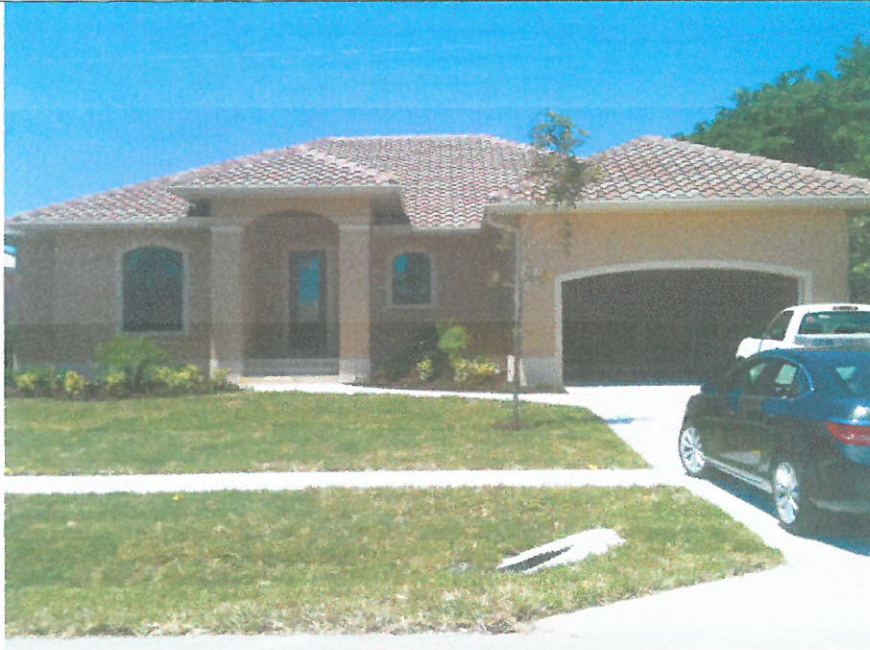
FRONT VIEW 4/24/2014

If using the Elevation Certificate to obtain NFIP flood insurance, affix at least 2 building photographs below according to the instructions for Item A6. Identify all photographs with date taken; "Front View" and "Rear View"; and, if required, "Right Side View" and "Left Side View." When applicable, photographs must show the foundation with representative examples of the flood openings or vents, as indicated in Section A8. If submitting more photographs than will fit on this page, use the Continuation Page.