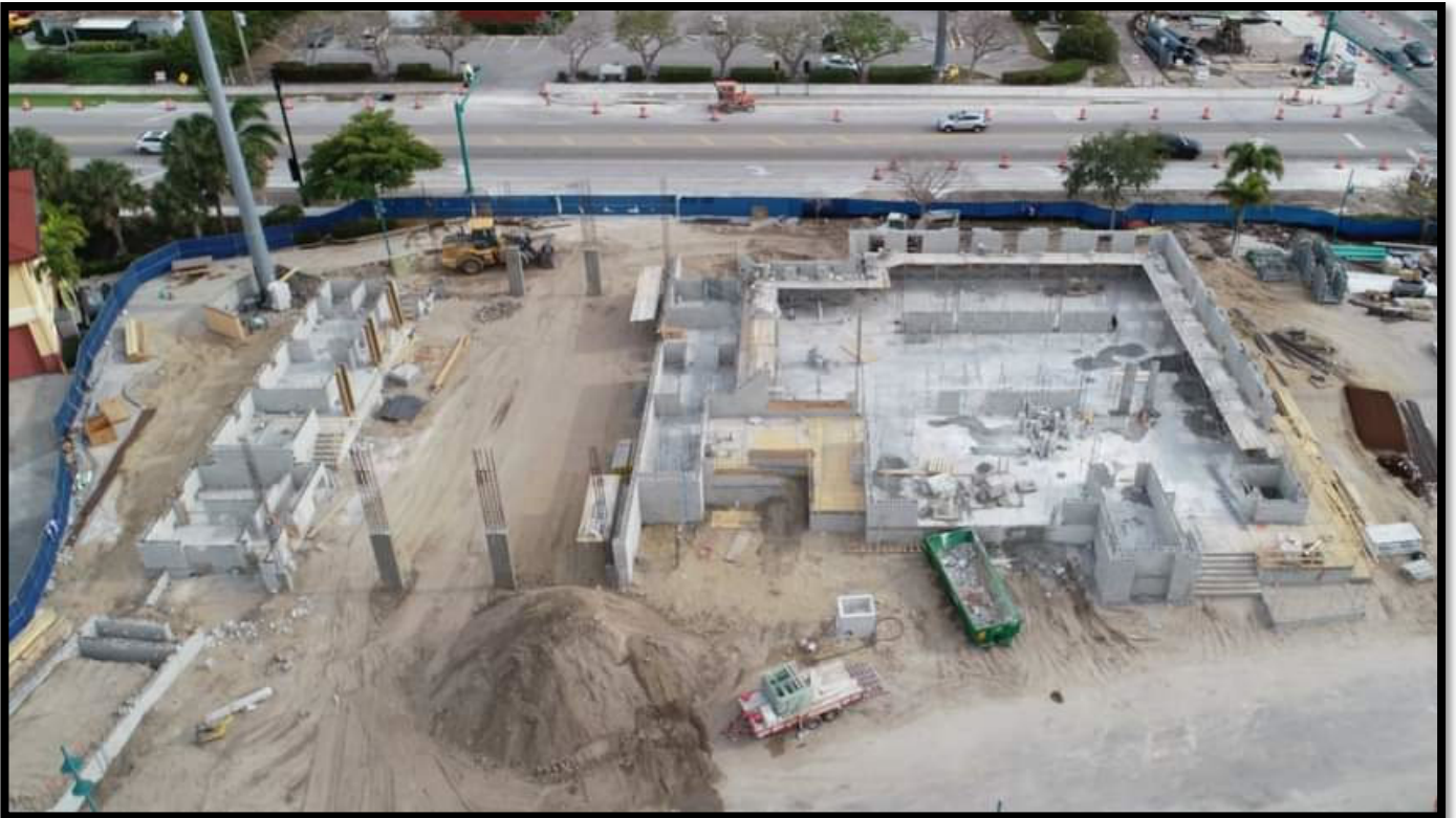
Fire Station 50 – April Aerial of Construction