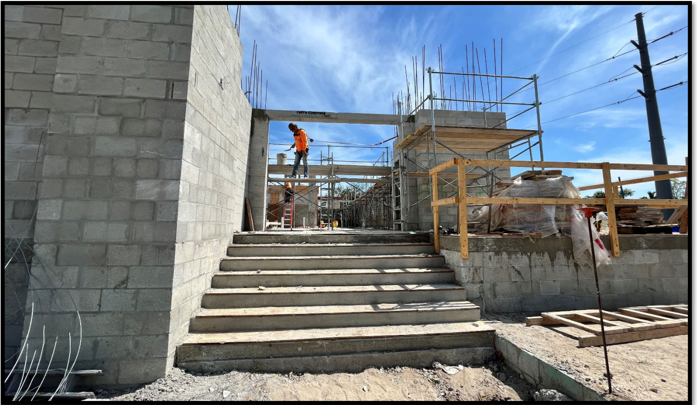
Fire Station 50 – CMU Walls (Front Entrance)