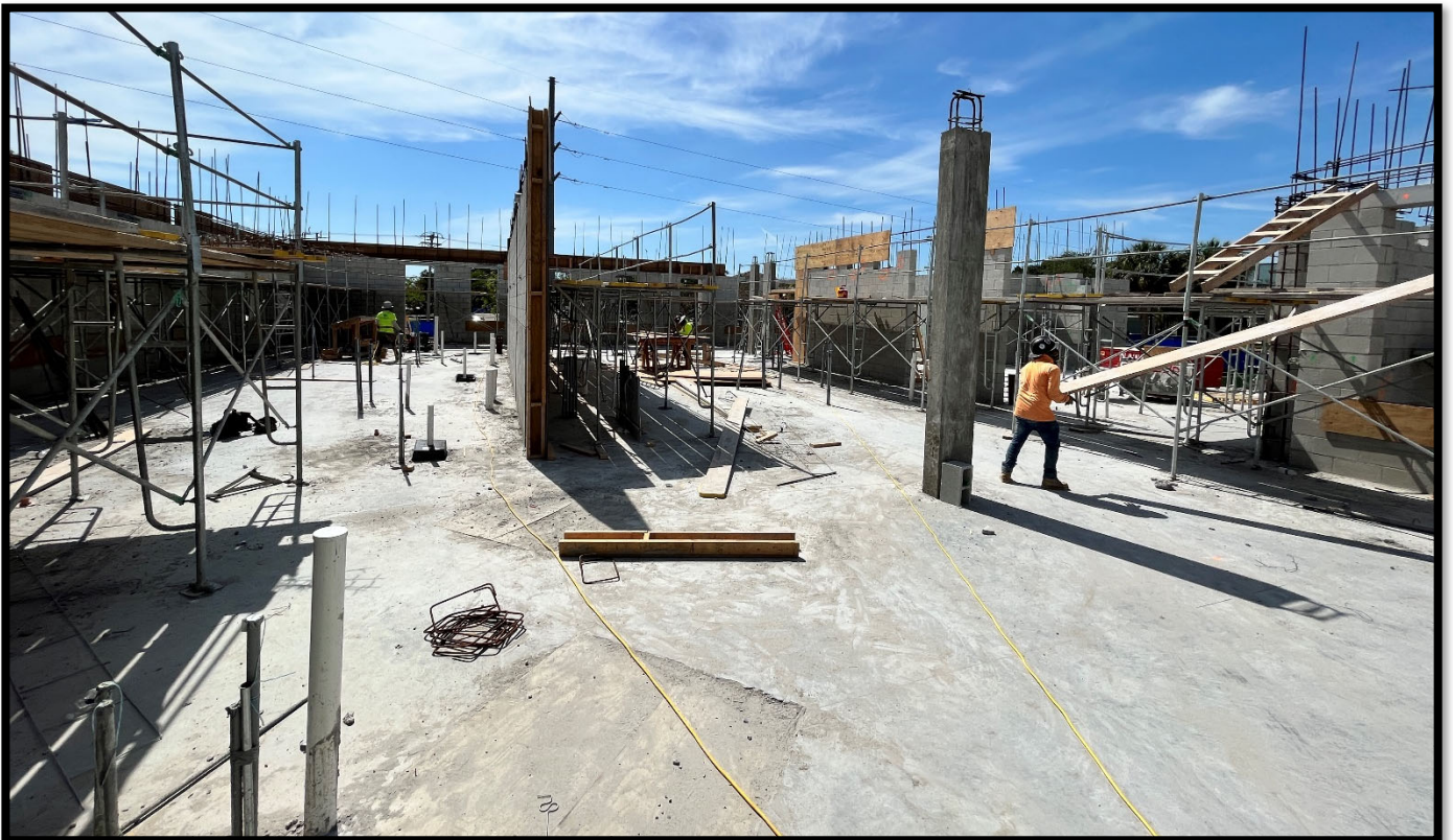
Fire Station 50 – CMU Walls (Interior)