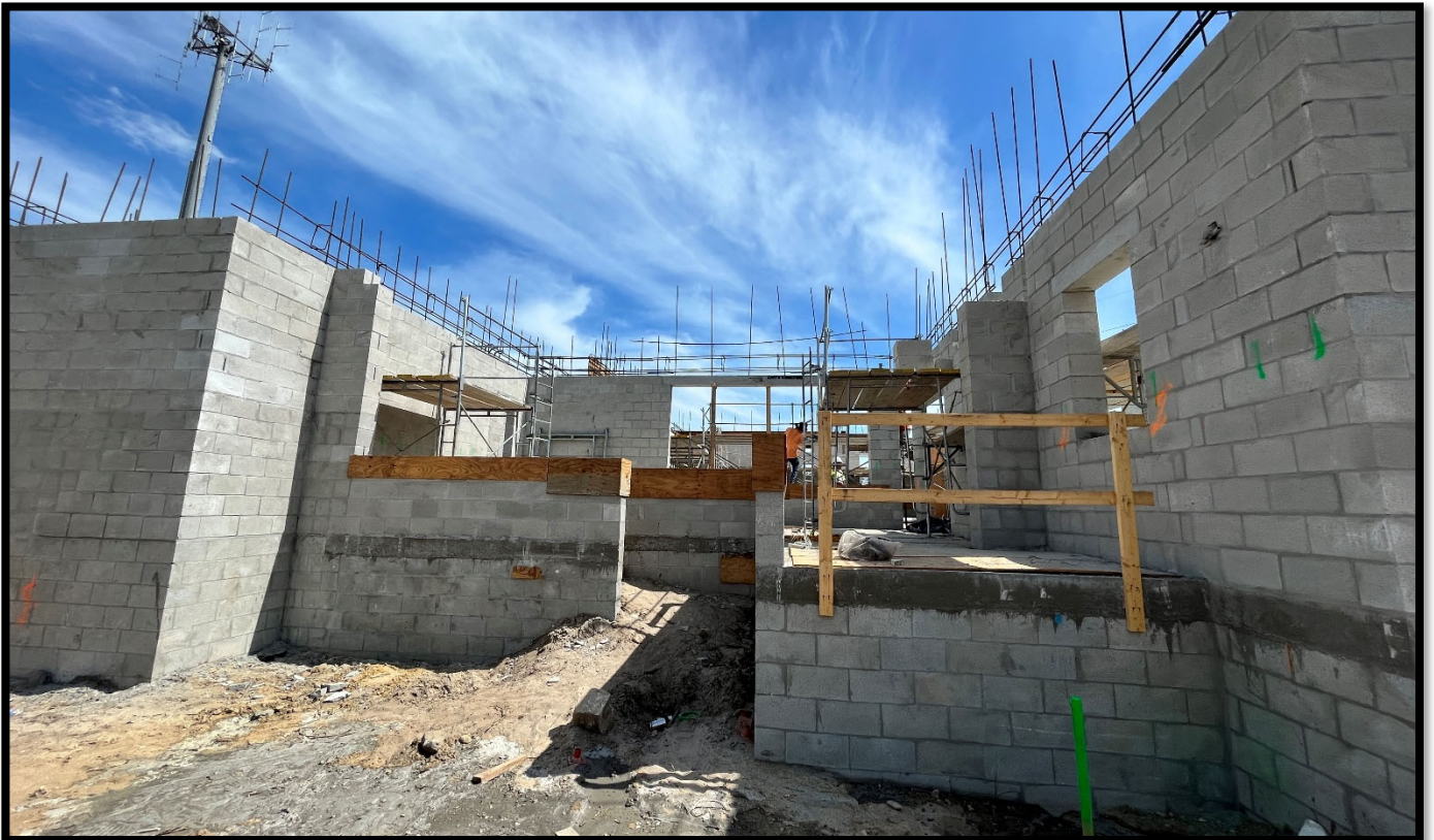
Fire Station 50 – CMU Walls