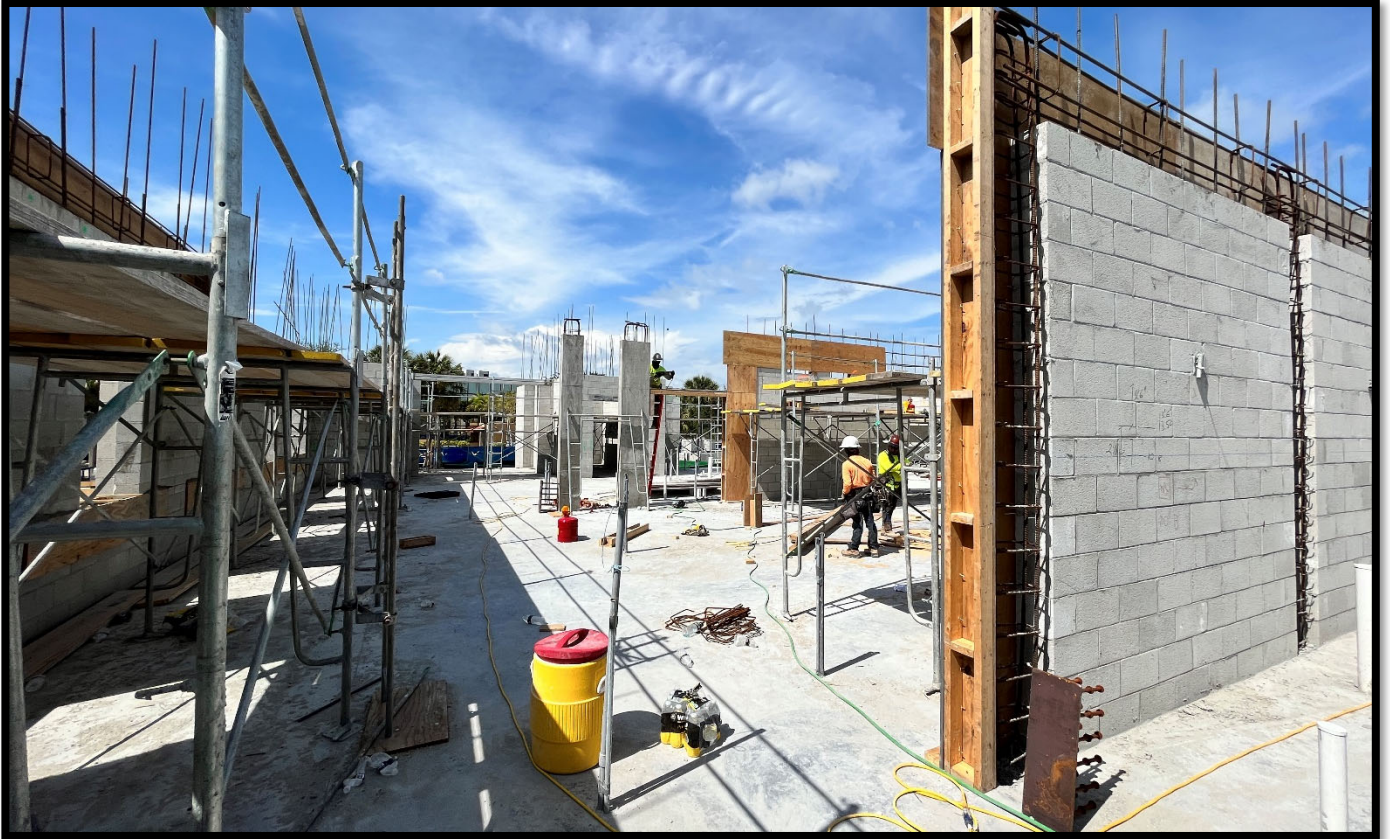
Fire Station 50 – CMU Walls (Interior)