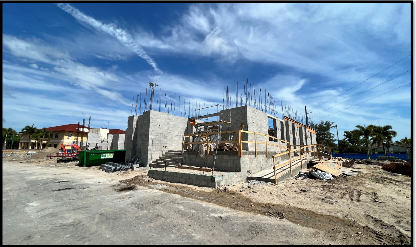
Fire Station 50 – CMU Walls