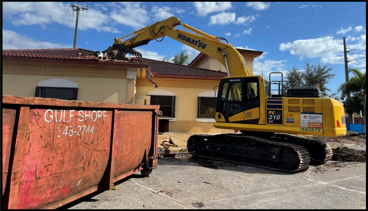
Fire Station 50 – Structure Demolition