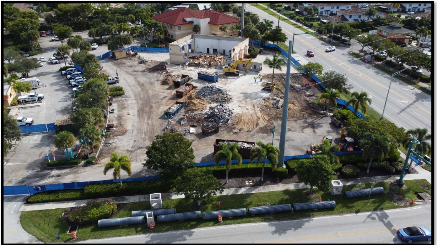
Fire Station – Structure Demolition Progress