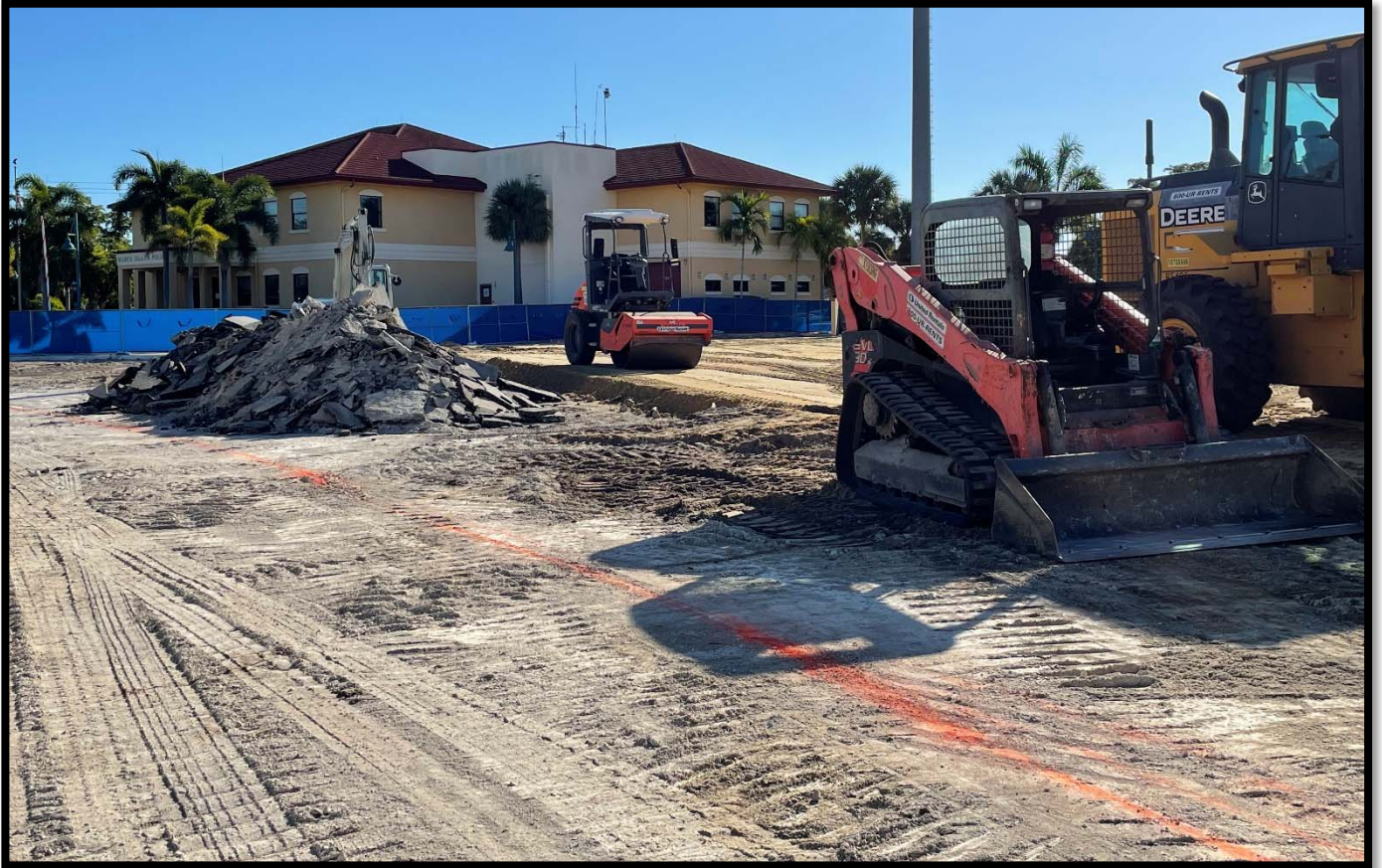
Fire Station 50 – Site Work: Fill Leveling