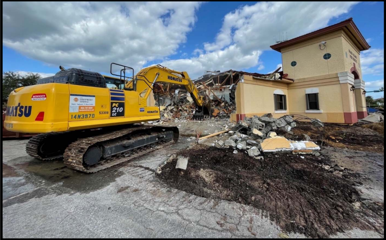
Fire Station 50 – Structure Demolition