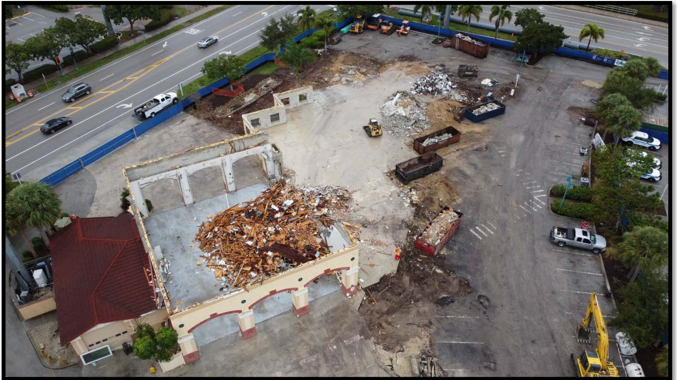
Fire Station 50 – Structure Demolition Progress