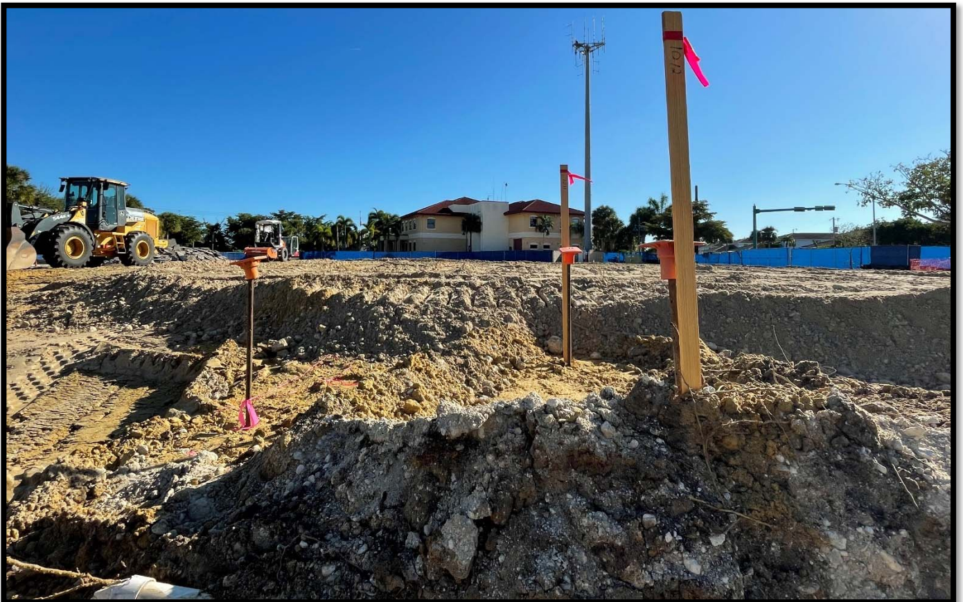
Fire Station 50 – Site Work: Fill Leveling and Layout Marking