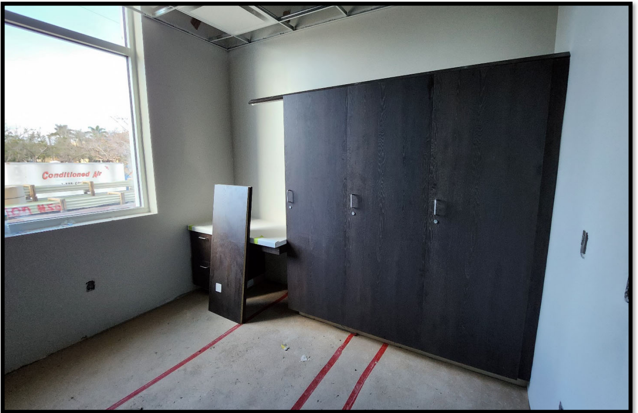
Fire Station 50 – Cabinetry Installation