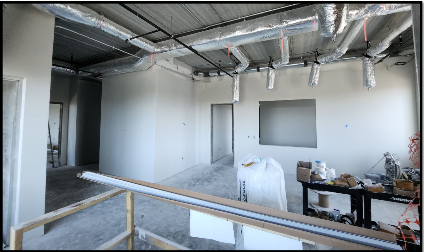
Fire Station 50 – Interior 2 nd Floor Lobby