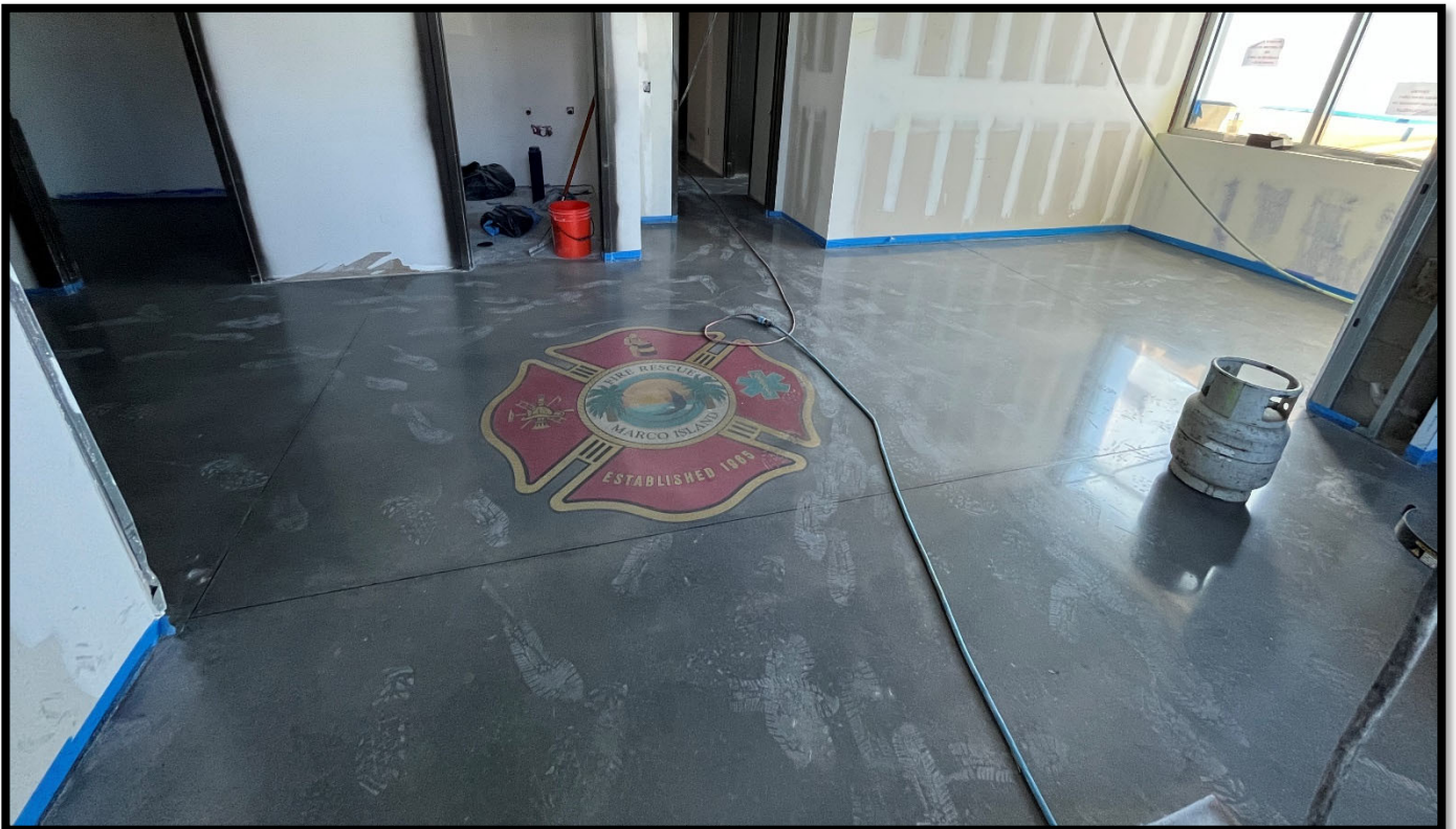
Fire Station 50 – Interior Flooring