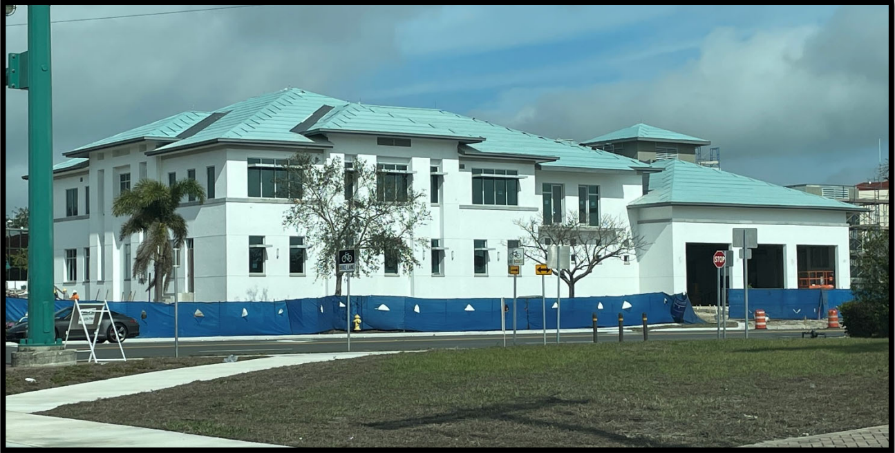
Fire Station 50 – Exterior Painting