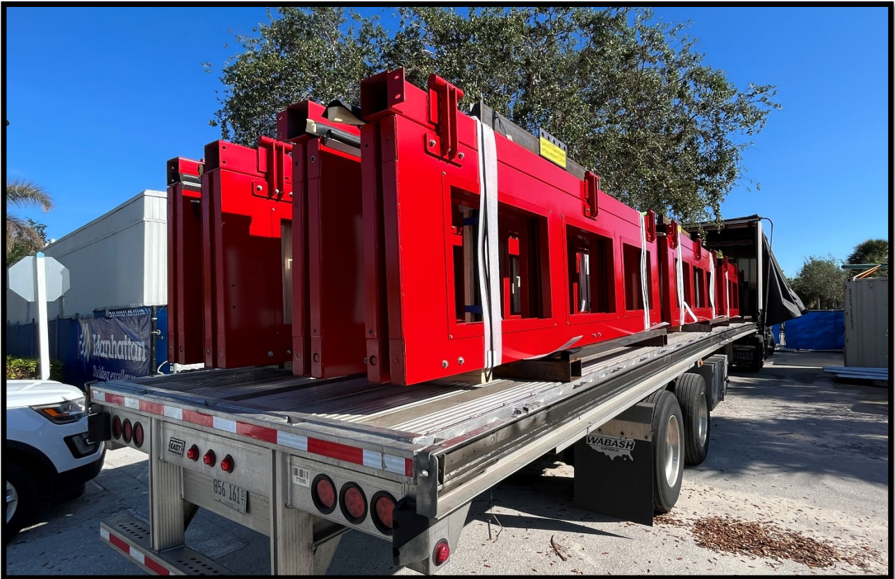
Fire Station 50 – Apparatus Bay Doors