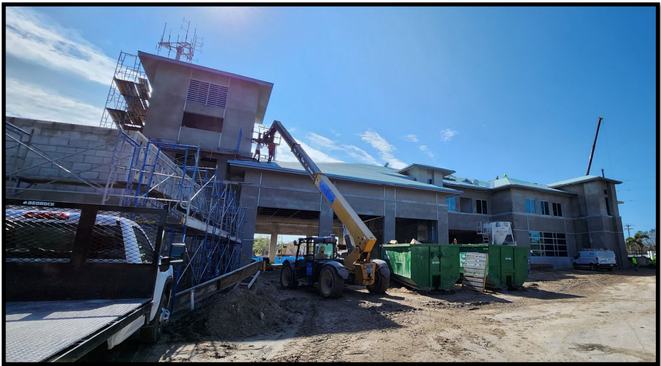
Fire Station 50 – Exterior / Stucco