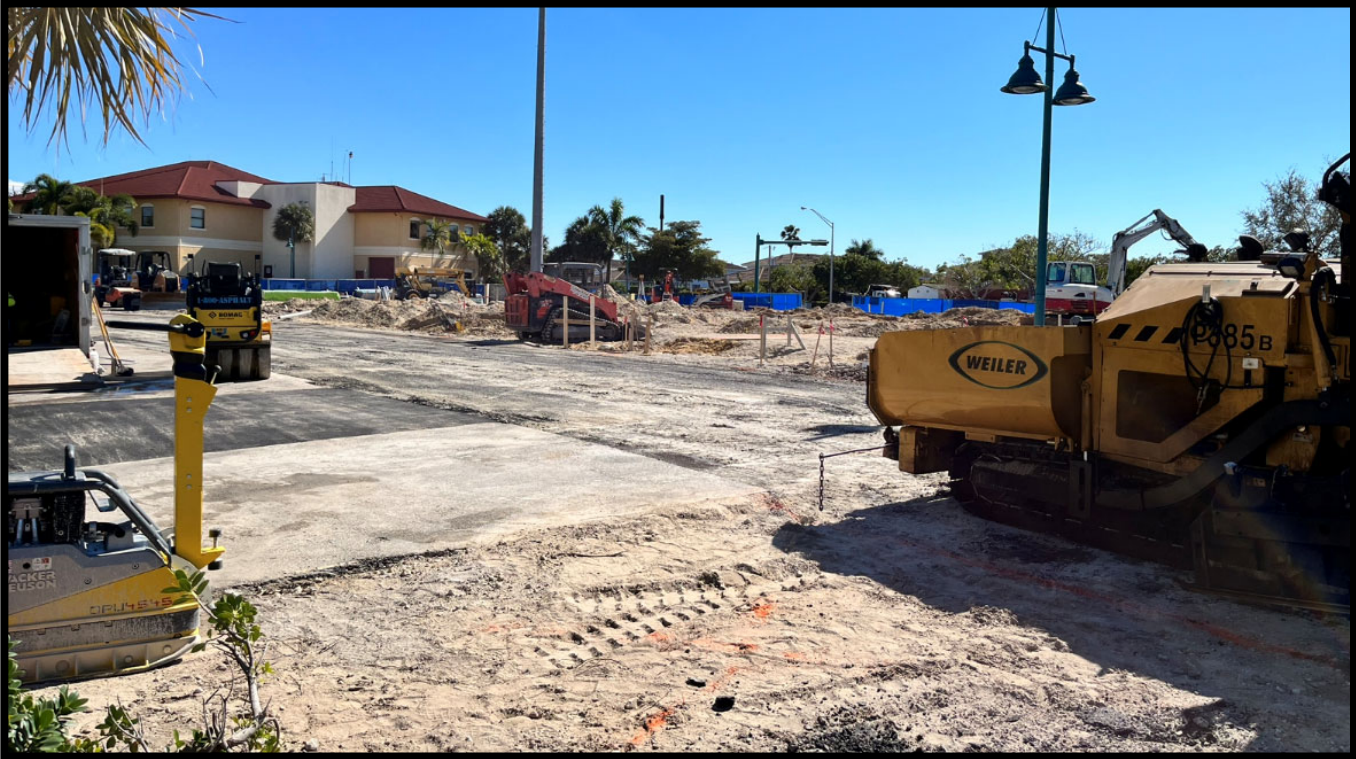
Fire Station 50 – Site Work: Asphalt