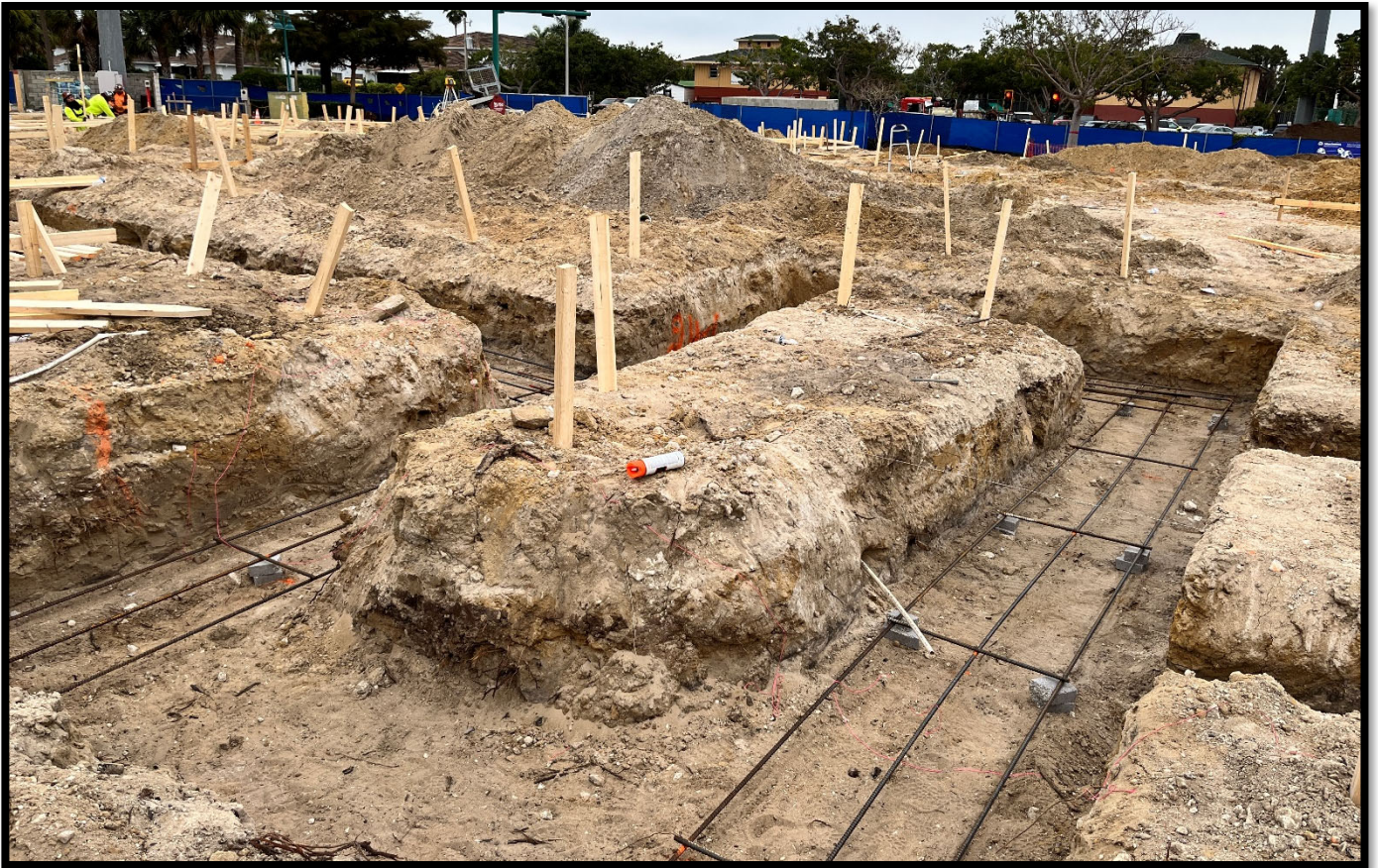
Fire Station 50 – Site Work: Footers/Rebar