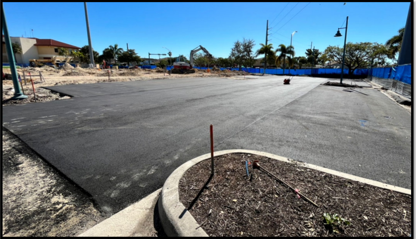
Fire Station 50 – Site Work: Asphalt