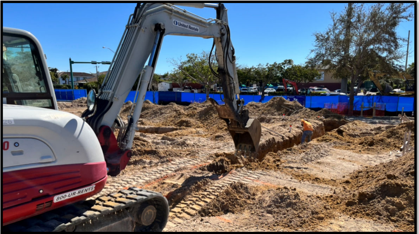
Fire Station 50 – Site Work: Footers