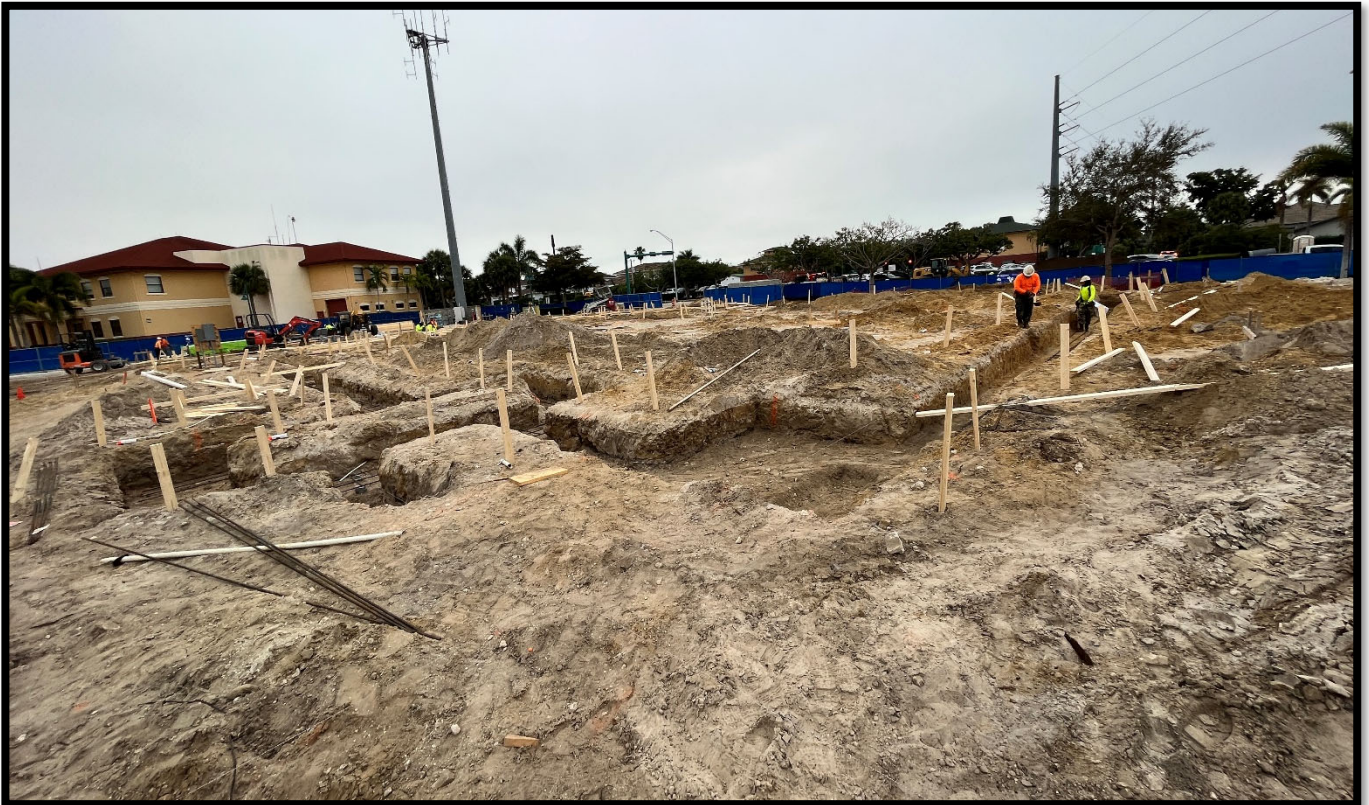
Fire Station 50 – Site Work: Footers