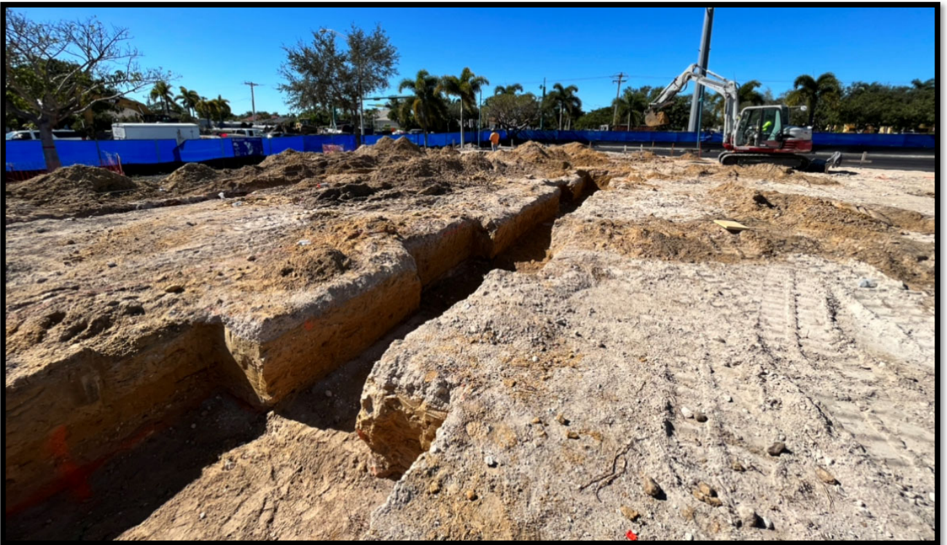
Fire Station 50 – Site Work: Footers