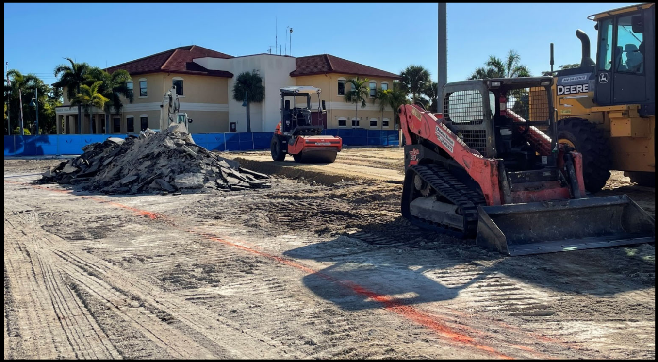
Fire Station 50 – Site Work: Fill Leveling