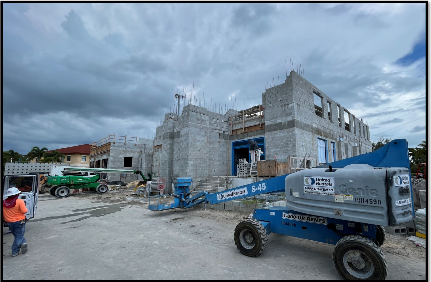
Fire Station 50 – Second Floor CMU Block Installation