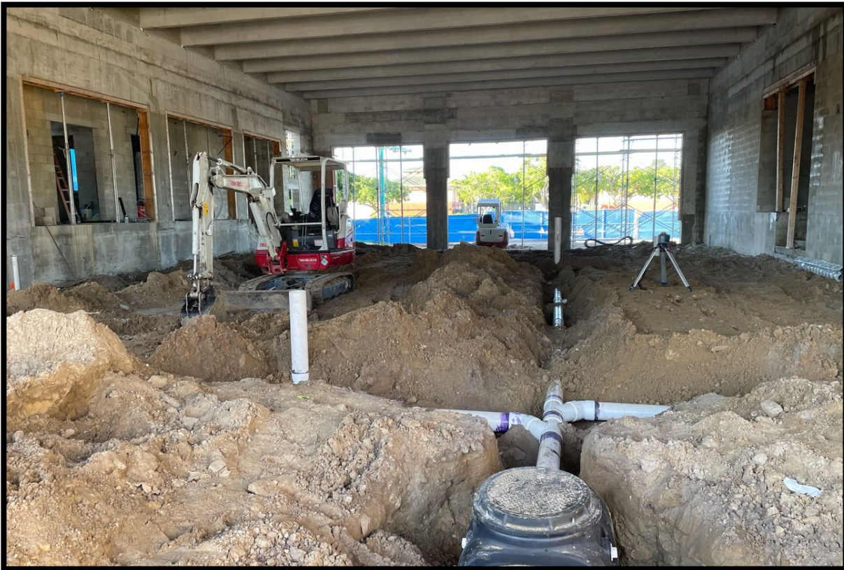
Fire Station 50 – Apparatus Bay Drainage System