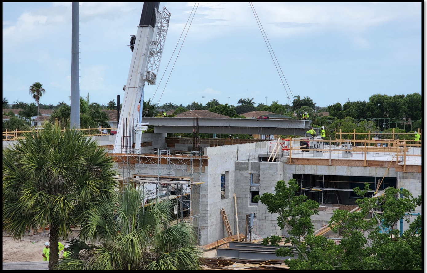
Fire Station 50 – Installation of Double T Beams Over Apparatus Bay