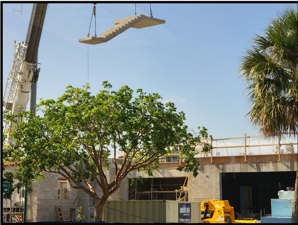
Fire Station 50 – Stair Installation