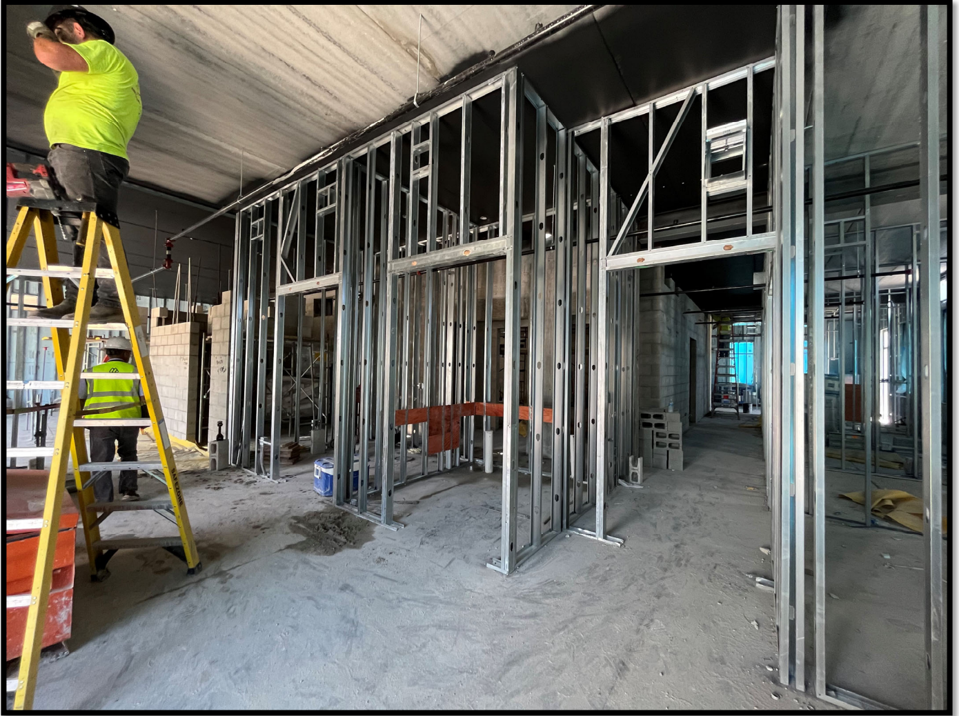
Fire Station 50 – Interior Framing