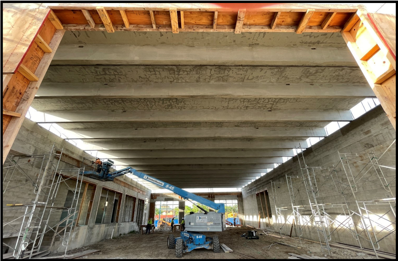
Fire Station 50 – Apparatus Bay Post Double T Beam Installation