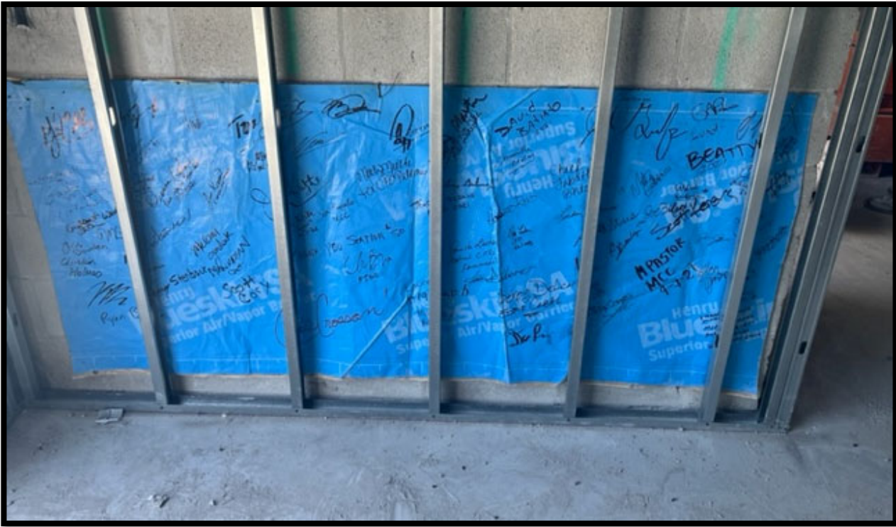
Fire Station 50 – Groundbreaking Ceremony Signatures Installed