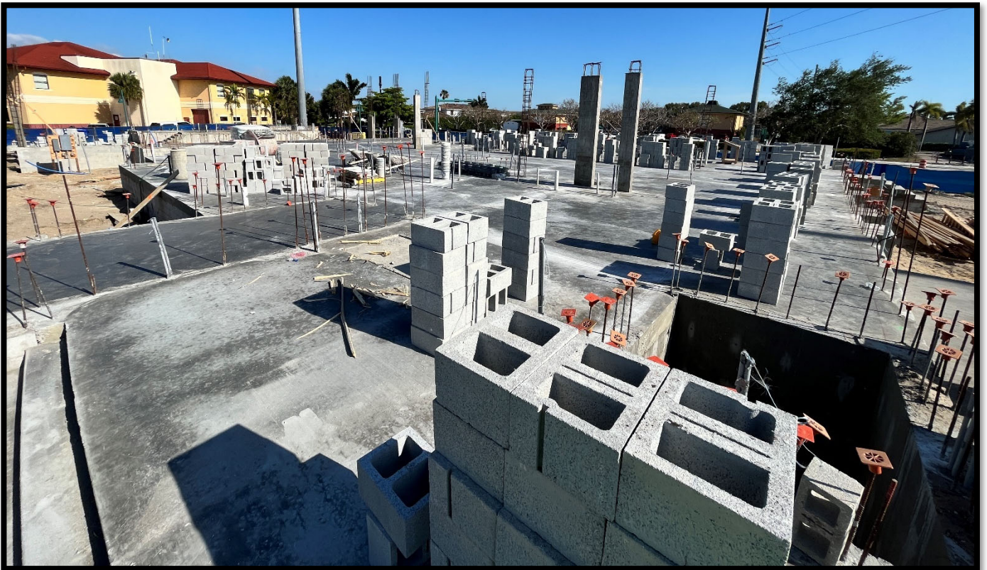
Fire Station 50 – Setup for CMU Walls