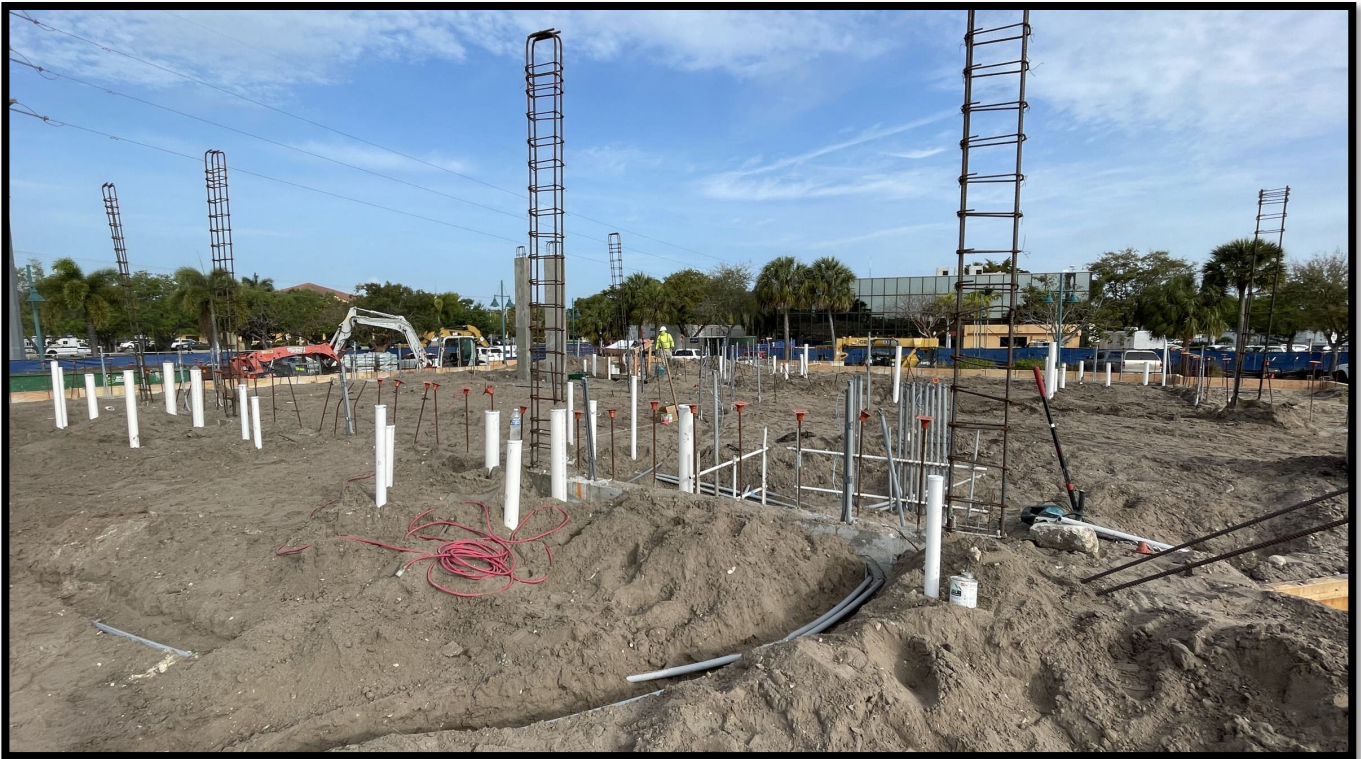
Fire Station 50 – Underground Electrical and Plumbing