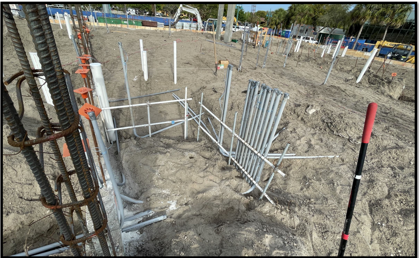
Fire Station 50 – Underground Electrical and Plumbing