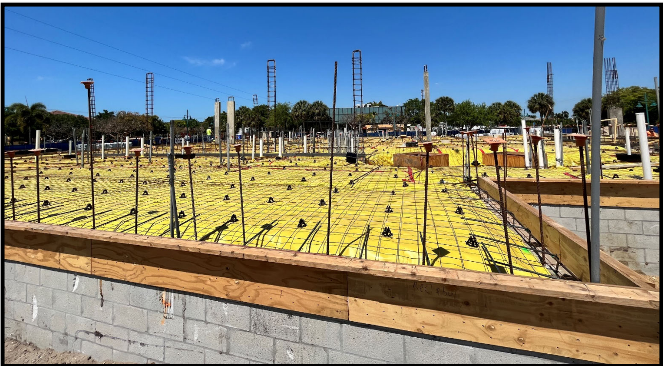
Fire Station 50 – Concrete Slab Prep