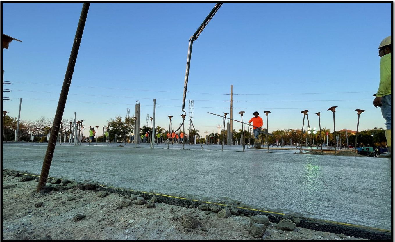
Fire Station 50 – Concrete Slab Pour