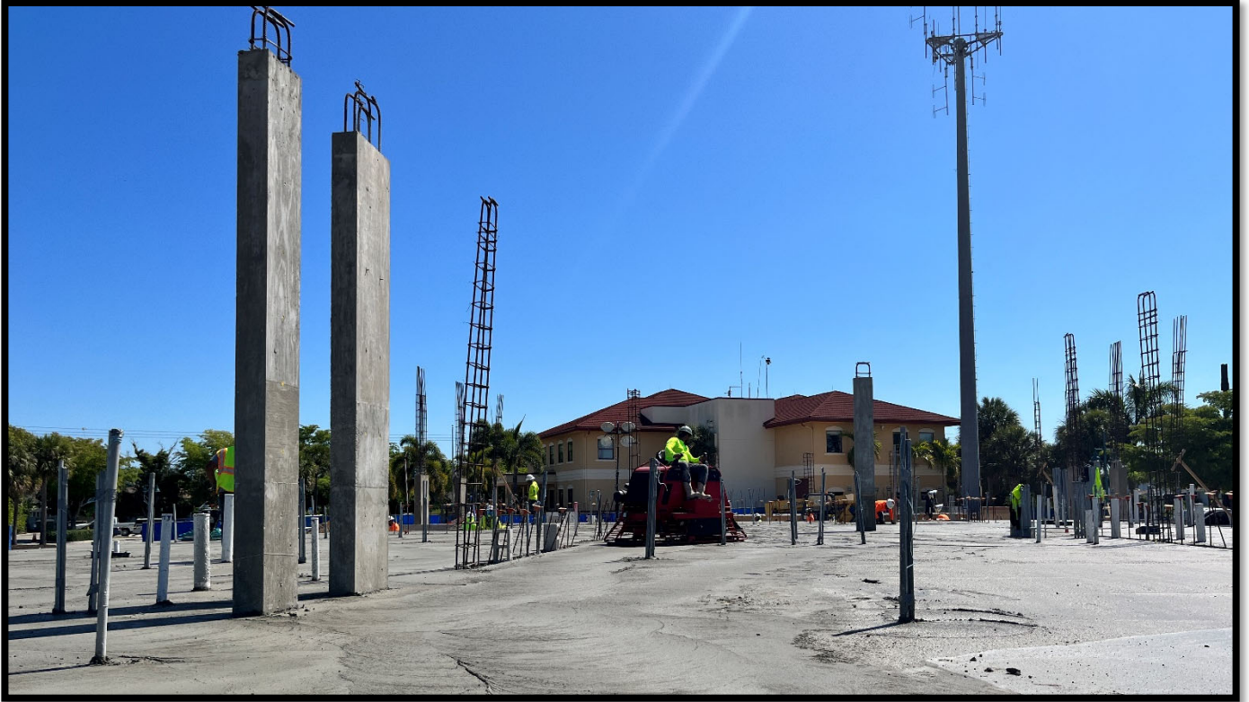
Fire Station 50 – Concrete Slab