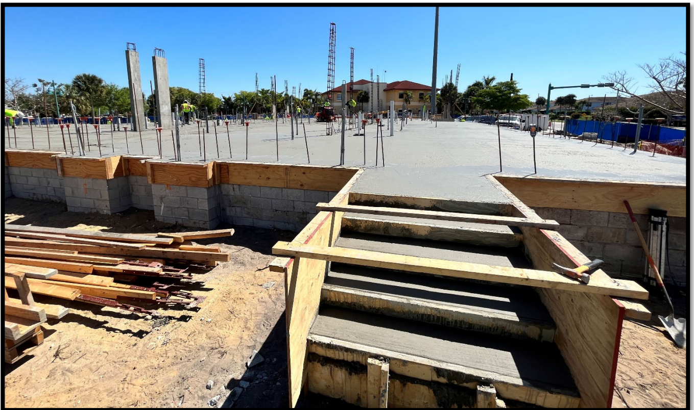
Fire Station 50 – Concrete Slab