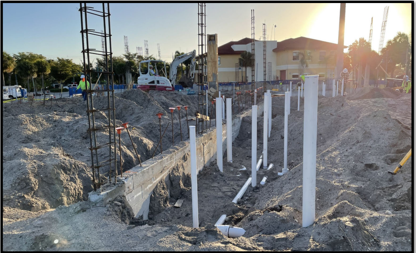
Fire Station 50 – Underground Plumbing