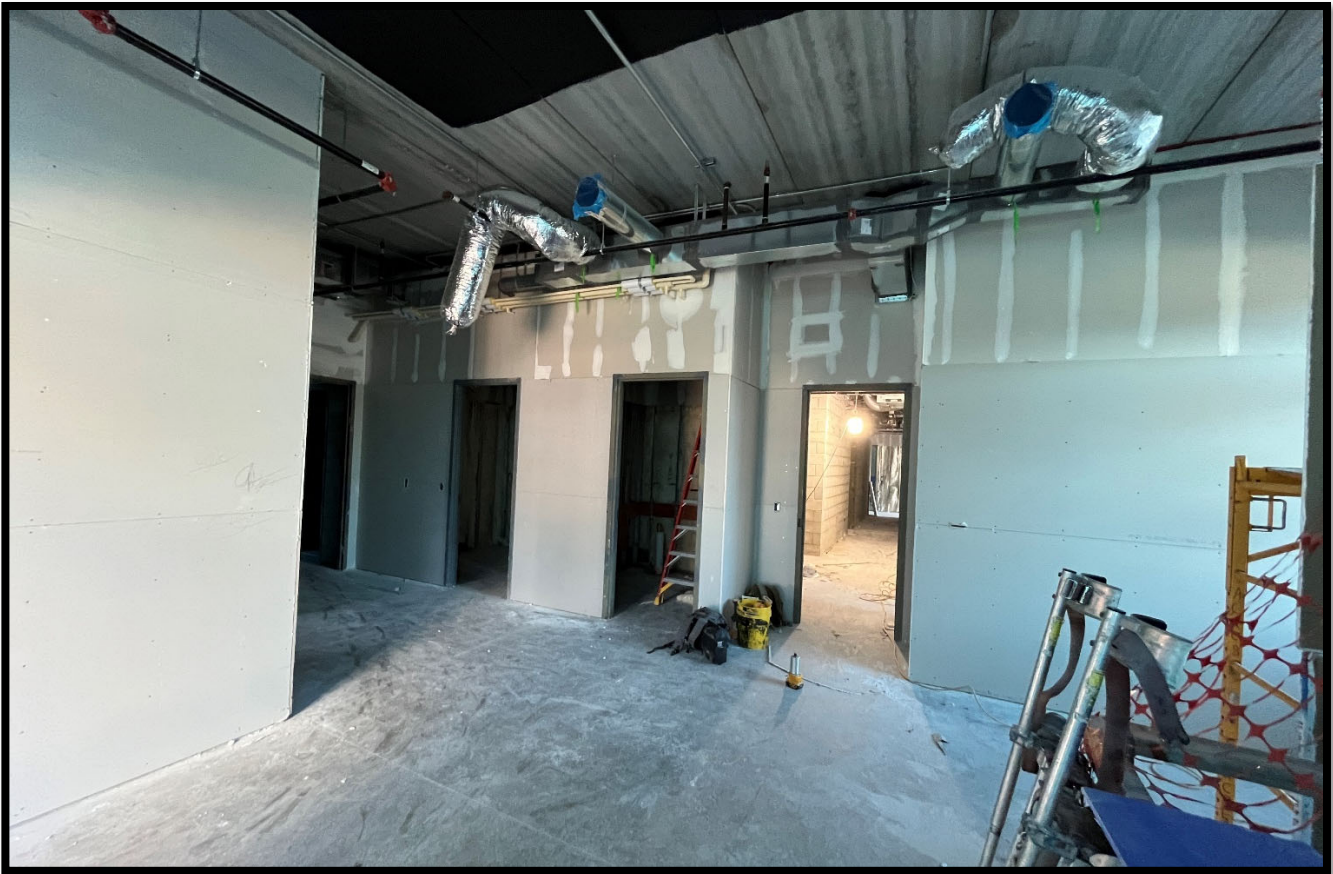
Fire Station 50 – 1 st Floor Lobby (Drywall and Insulation)