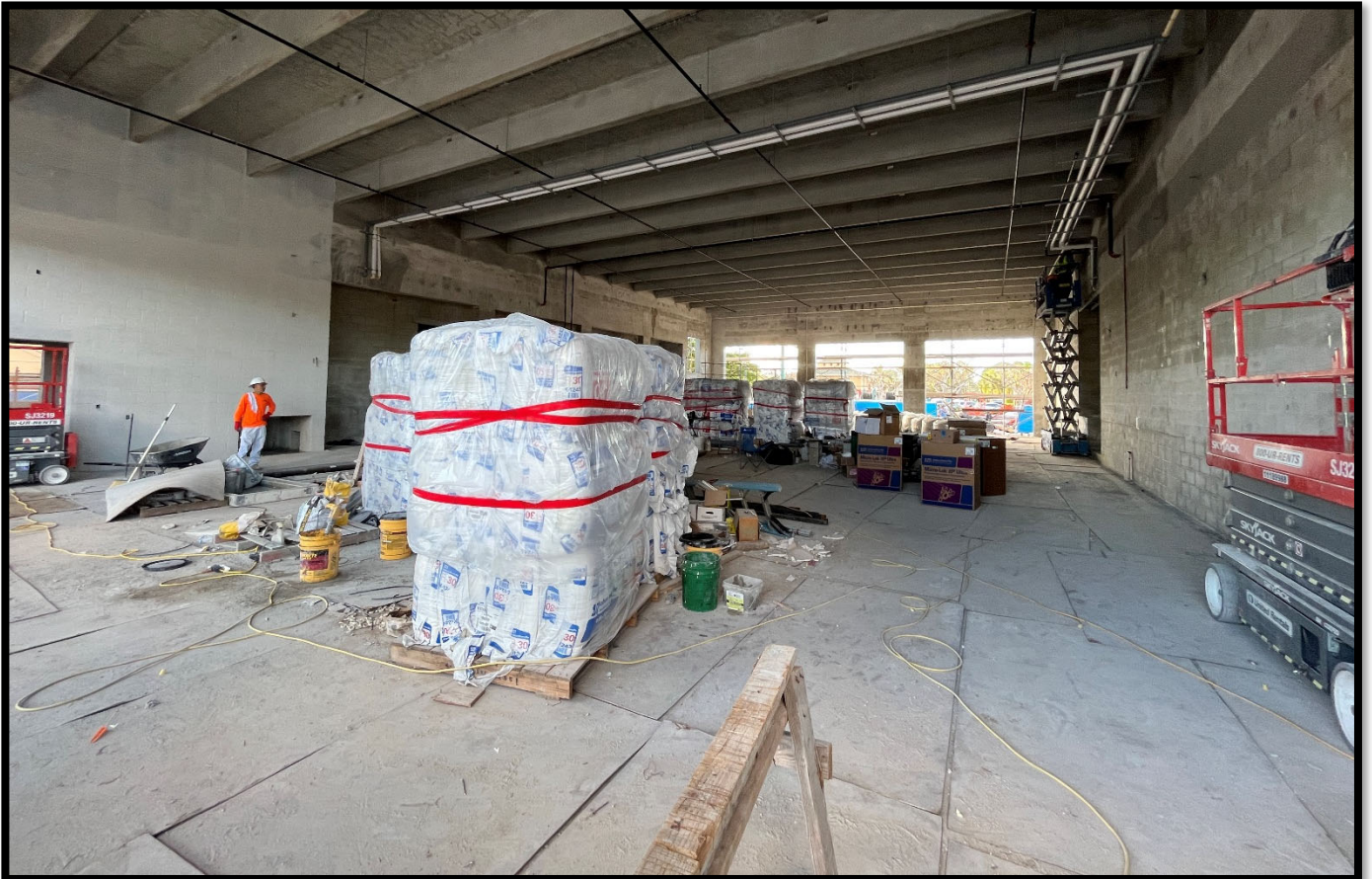
Fire Station 50 – Apparatus Bay