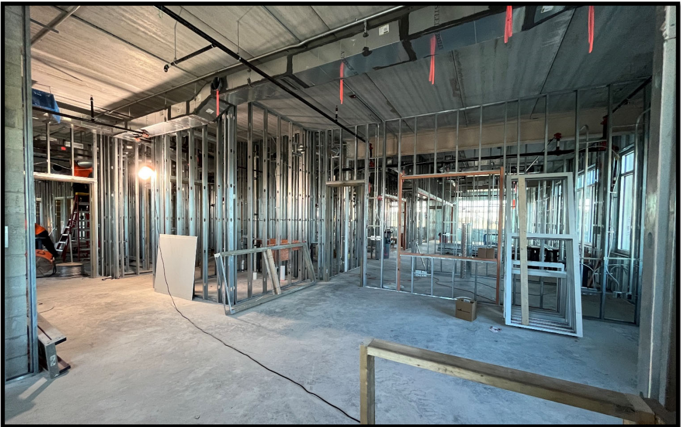
Fire Station 50 – Interior 2 nd Floor Lobby