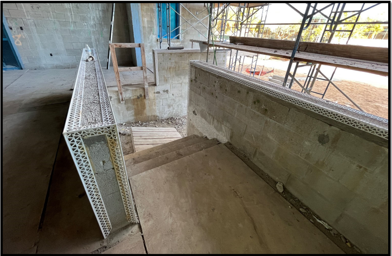
Fire Station 50 – Stucco Prep