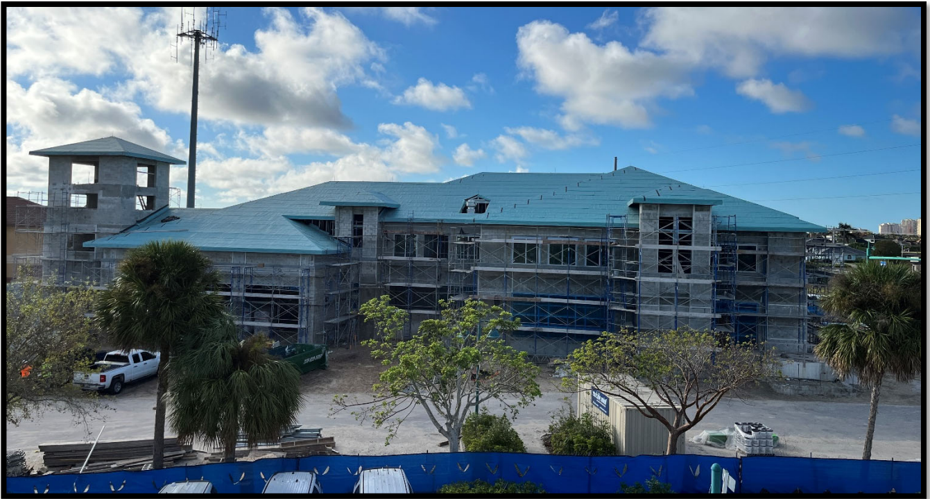
Fire Station 50 – Exterior / Roof Membrane Complete