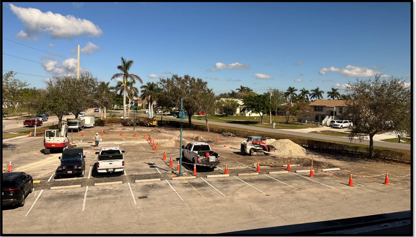
Fire Station 50 – City Hall Front Parking Lot Improvements