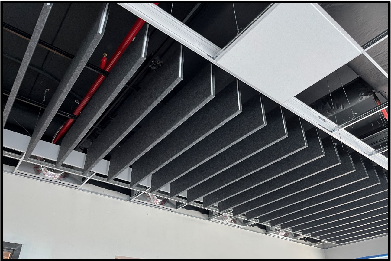
Fire Station 50 – 2 nd Suspended Ceiling