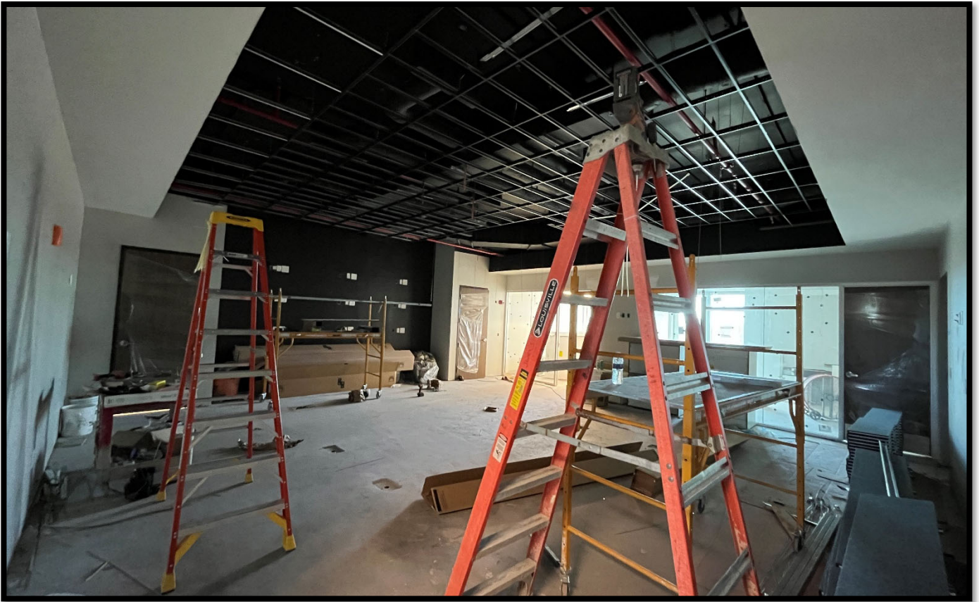
Fire Station 50 – 2 nd Floor EOC