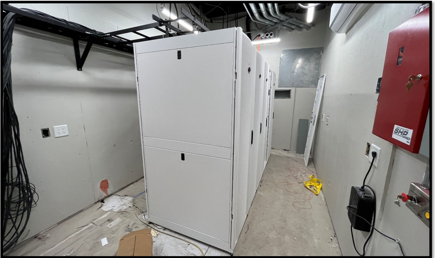
Fire Station 50 – Data Center