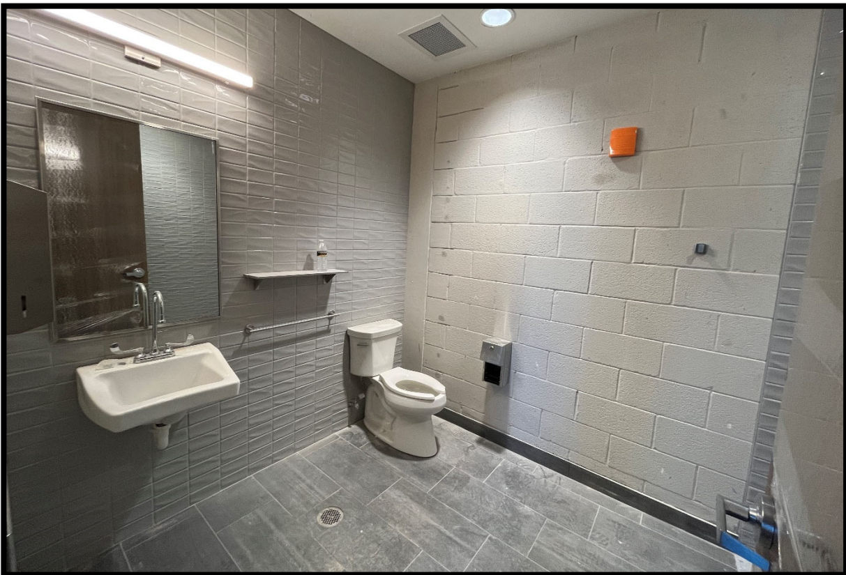
Fire Station 50 – 1 st Floor Restrooms