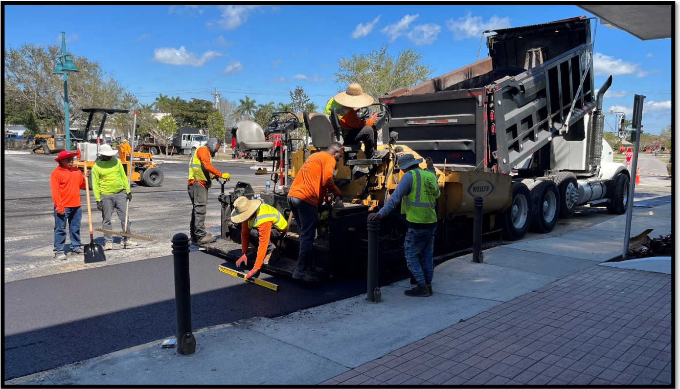
Fire Station 50 – Paving (City Hall Front Lot)