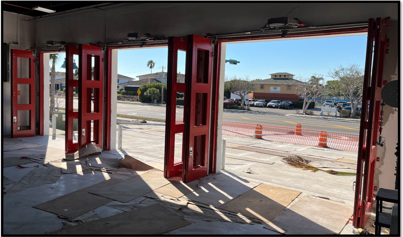
Fire Station 50 – Apparatus Bay Doors