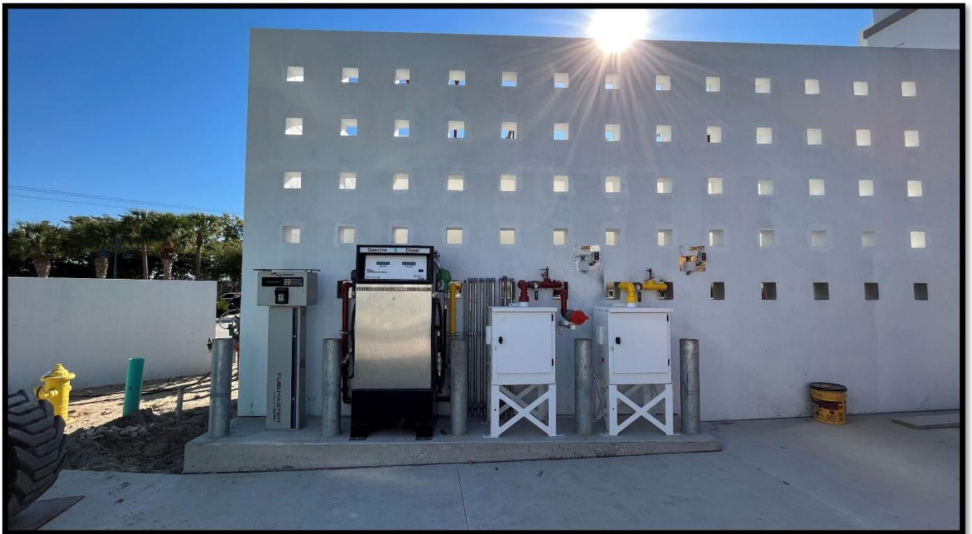
Fire Station 50 – Fuel Island and Pump