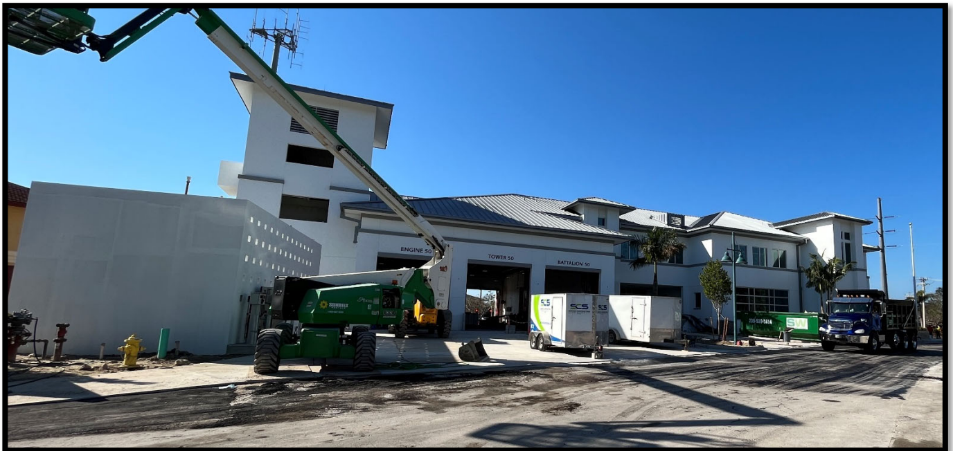
Fire Station 50 – Exterior / Painting