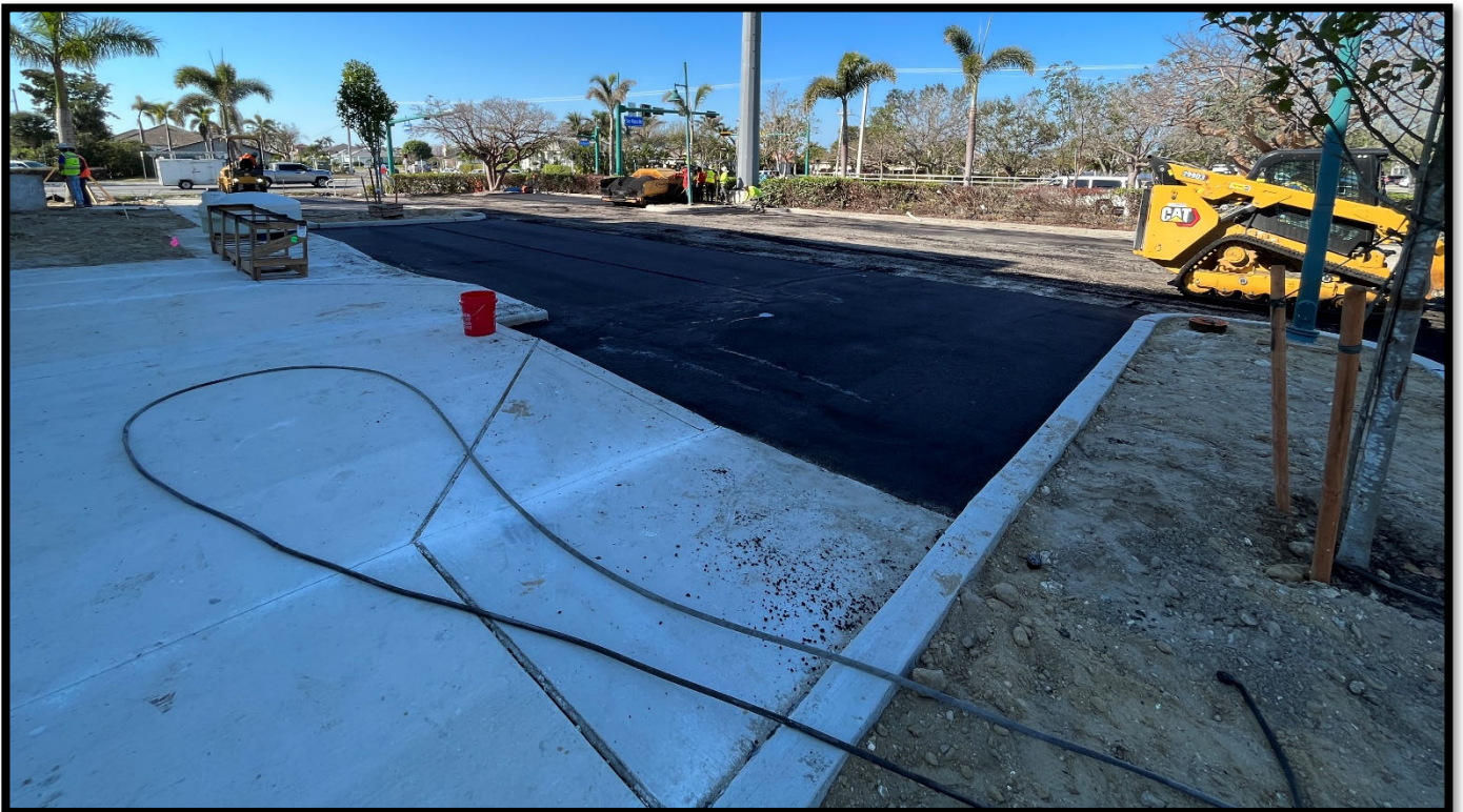
Fire Station 50 – Paving