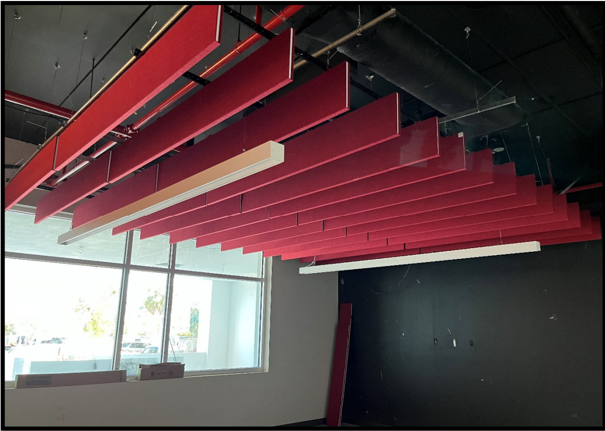
Fire Station 50 – Suspending Ceiling (Baffles)