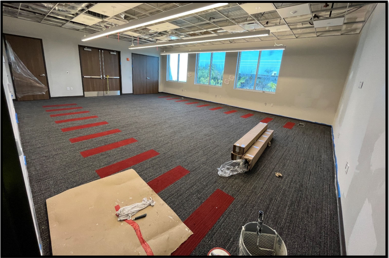
Fire Station 50 – Community Training Room