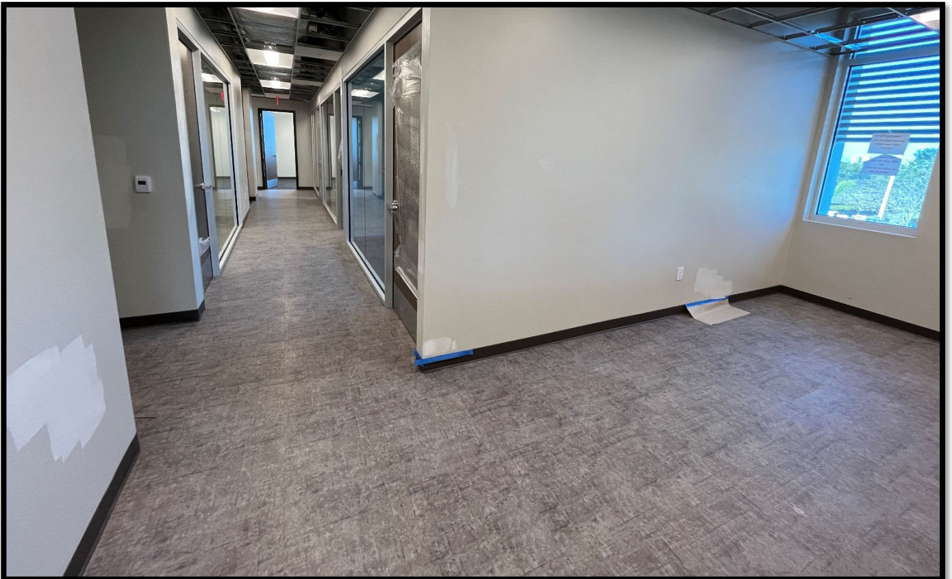
Fire Station 50 – Interior Flooring