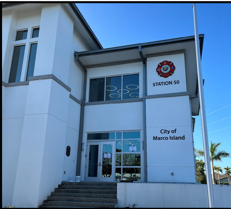
Fire Station 50 – Exterior Signage