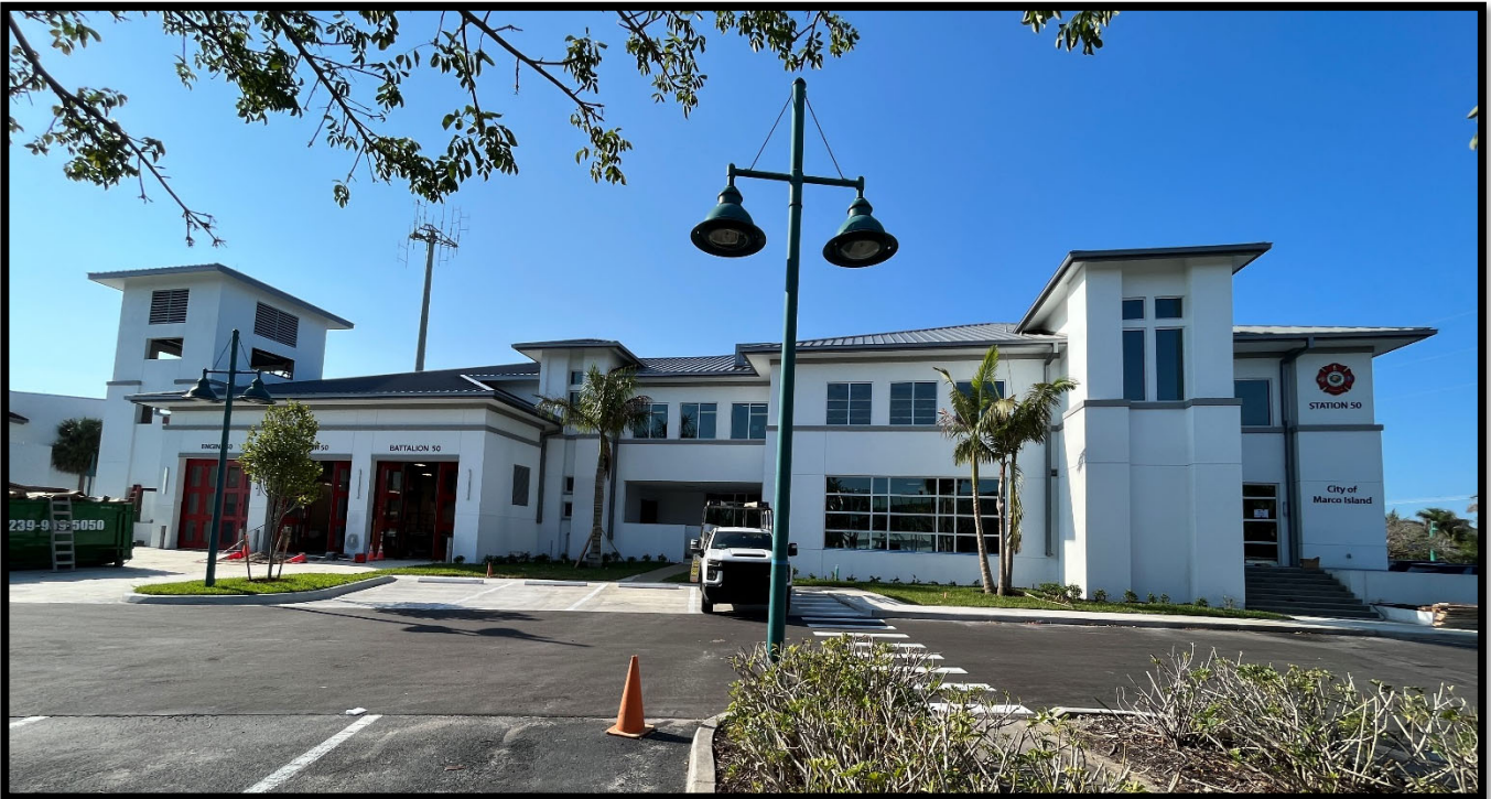
Fire Station 50 – Exterior / Painting