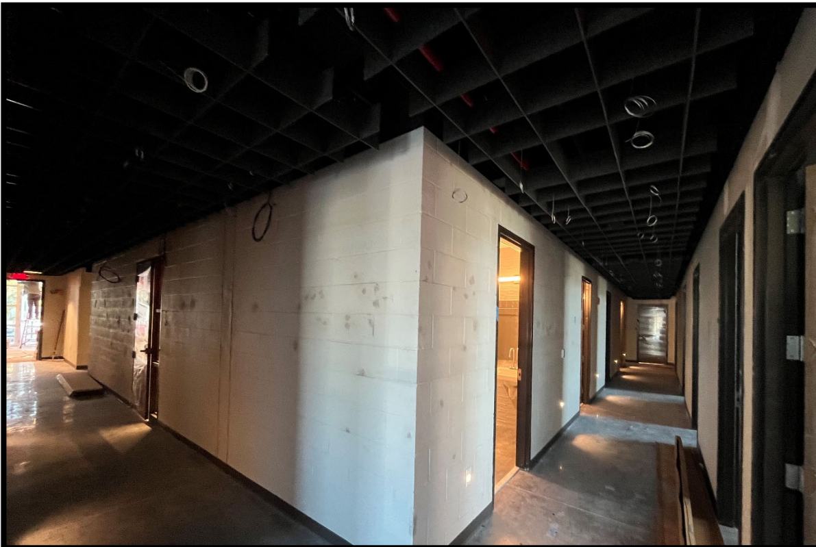
Fire Station 50 – Suspending Ceiling (Baffles)