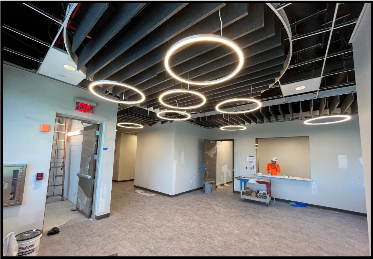
Fire Station 50 – 2 nd Floor Lobby