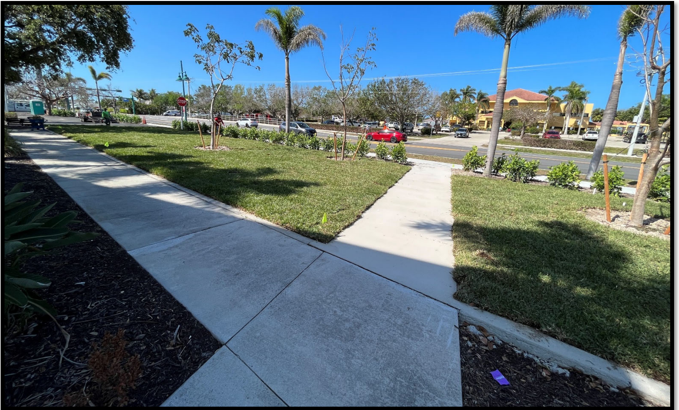
Fire Station 50 – New Landscape Area Next to City Hall