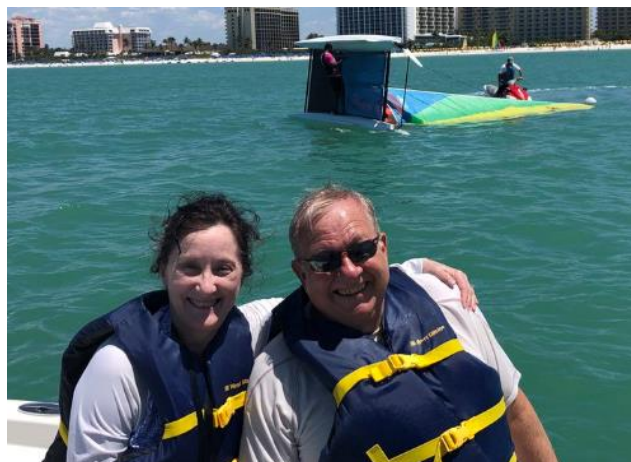
PD Marine Patrol rescued people on an overturned boat and brought them back to shore April 12. Wear your PFD!

OPEN CLOSED CLEARED INACTIVE PENDING TOTAL 9 68 15 11 10 103