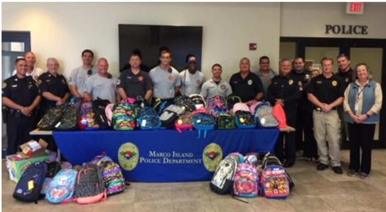
This is the ninth year for Marco Island Police, Fire and City employees participating in the Give Back-Fill a Pack initiative, in support of the Shelter and Abused Women and Children.