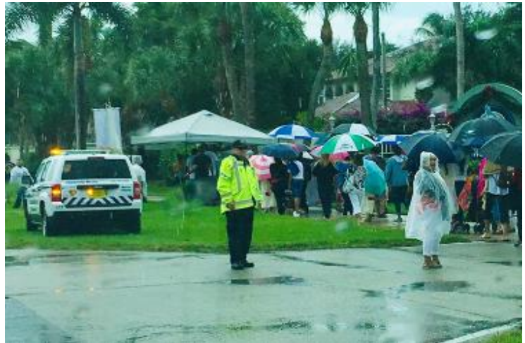
Community Services Officers assist at Our Lady of Guadalupe Procession