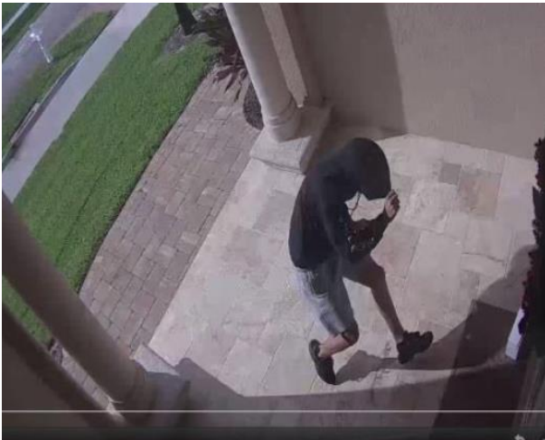
Young Male caught on security camera regarding theft from Marco resident's porch