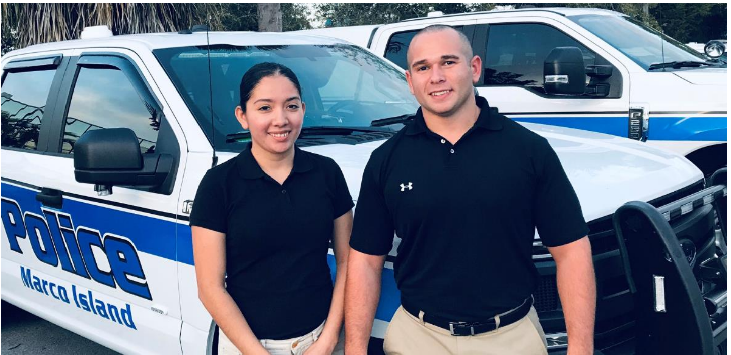
Our two newest Officers began December 27 th , 2018.