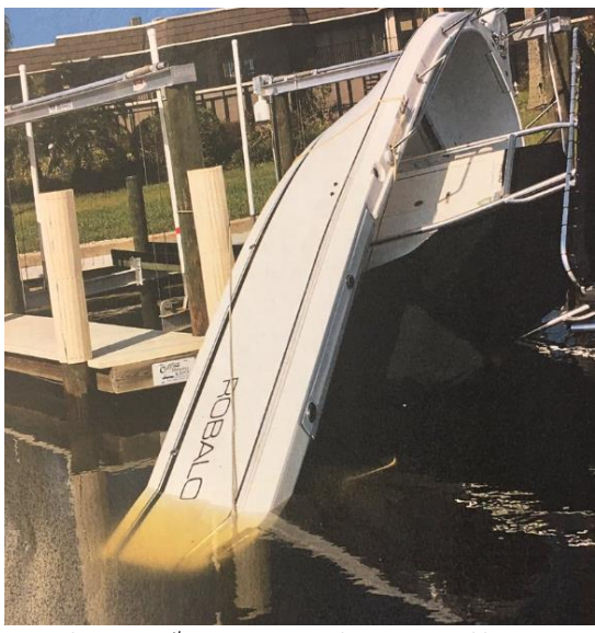
February 15<sup>th</sup> Waterway Debris Removal begins