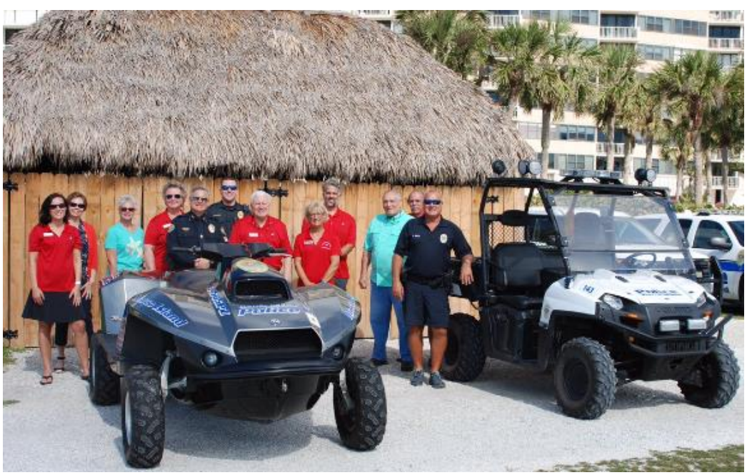
February 9th dedication of the Police Department Beach Hut at MICA Residents Beach

Re: February 2018 Monthly City Council Report