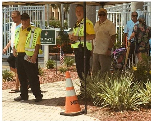
Community Service Officers assist with pedestrian traffic on 4 th of July