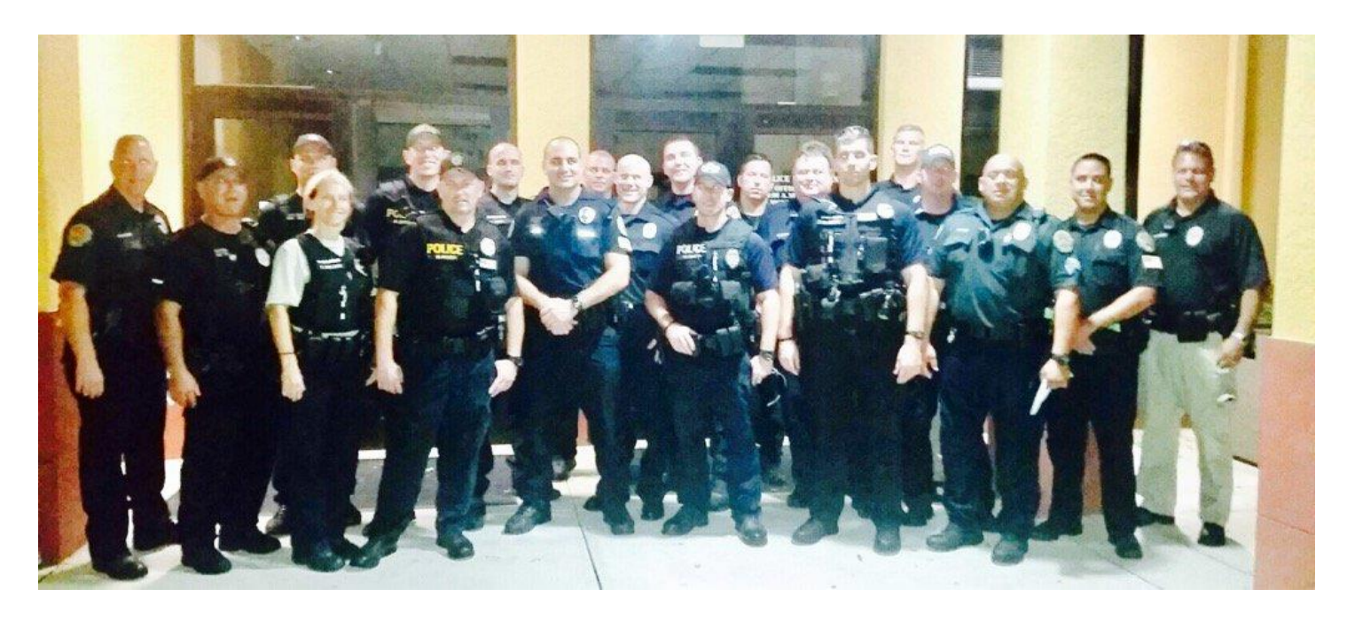
Many Thanks to our 1st Contingent, Jupiter Police Officers September 15, 2017