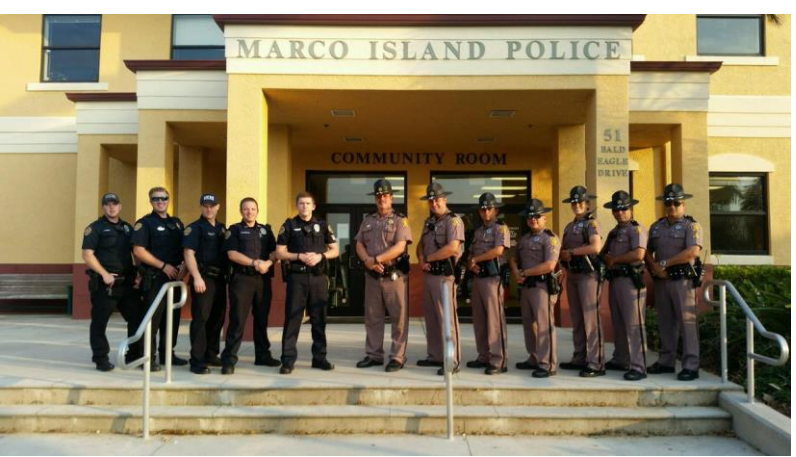
Thin Blue Line grows stronger with help of Florida Highway Patrol September 21, 2017