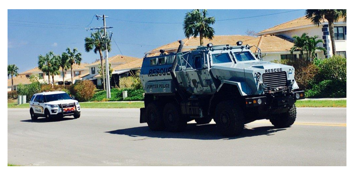
MIPD escorting Jupiter Rescue Vehicle off the Island September 18, 2017